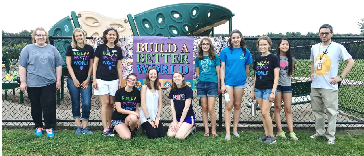
End of Summer Party with Staff and Volunteers