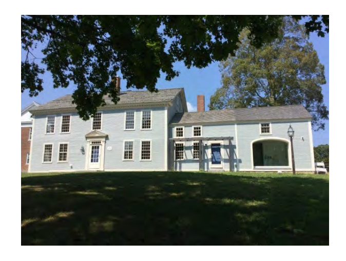
Town of Sudbury ADA Transition Plan