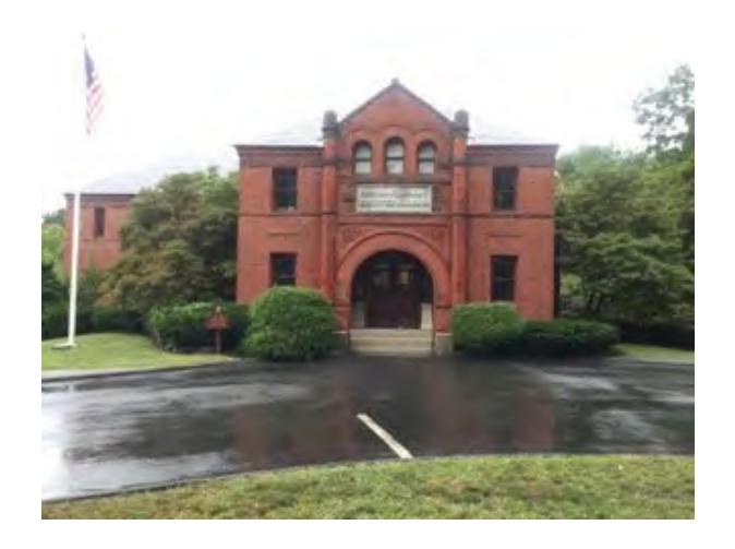
Town of Sudbury ADA Transition Plan