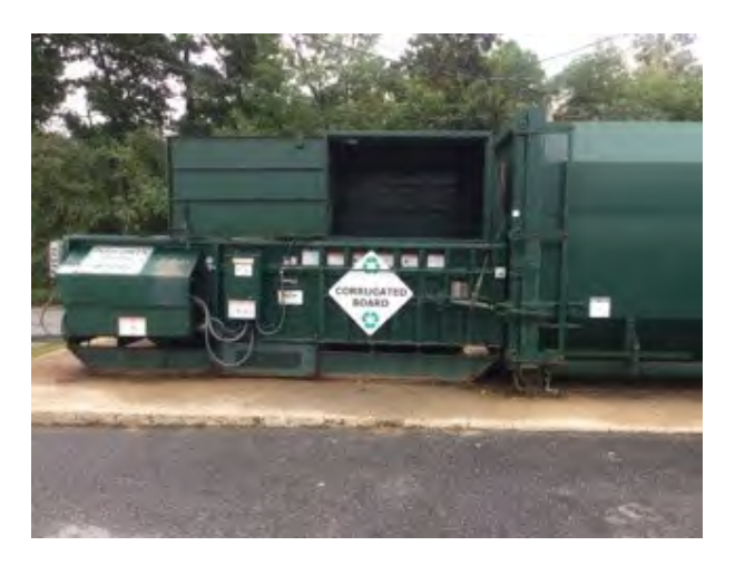
Town of Sudbury ADA Transition Plan