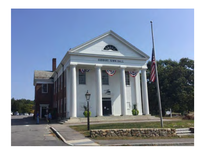
Town of Sudbury ADA Transition Plan