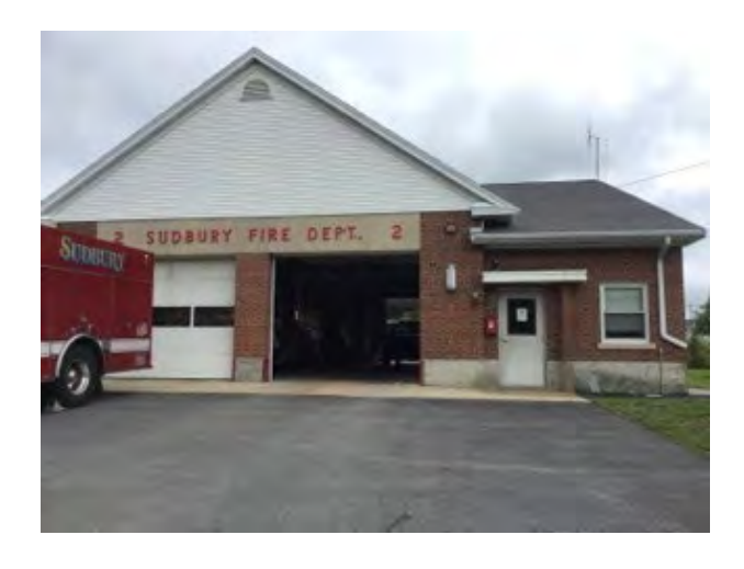
Town of Sudbury ADA Transition Plan