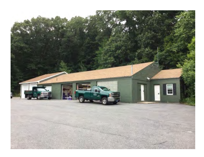
Town of Sudbury ADA Transition Plan