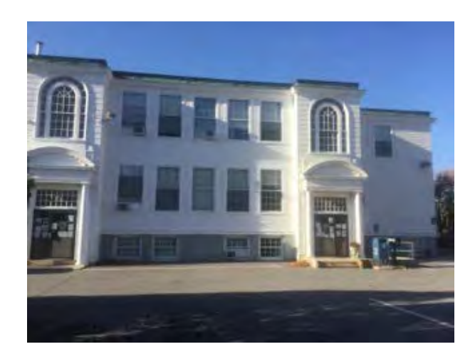
Town of Sudbury ADA Transition Plan