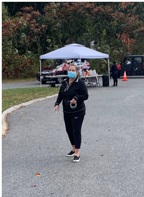
Top Left: Public health nurse administering shots.