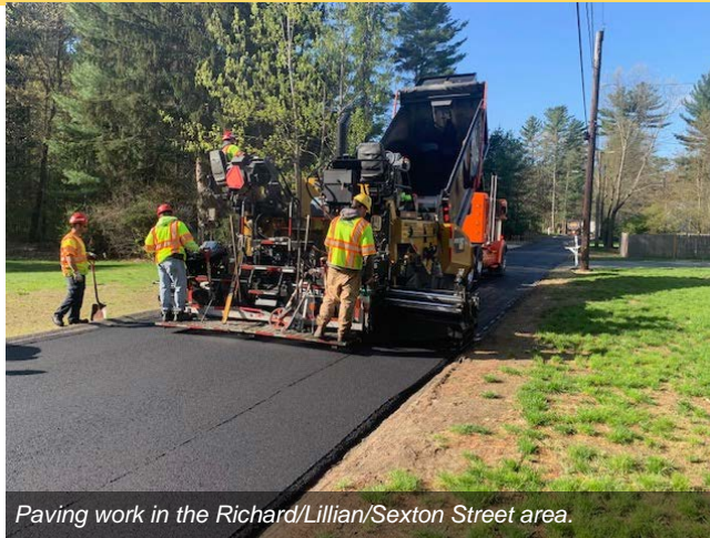
Paving work in the Richard/Lillian/Sexton Street area.