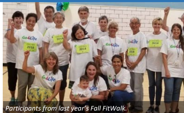
Participants from last year's Fall FitWalk.