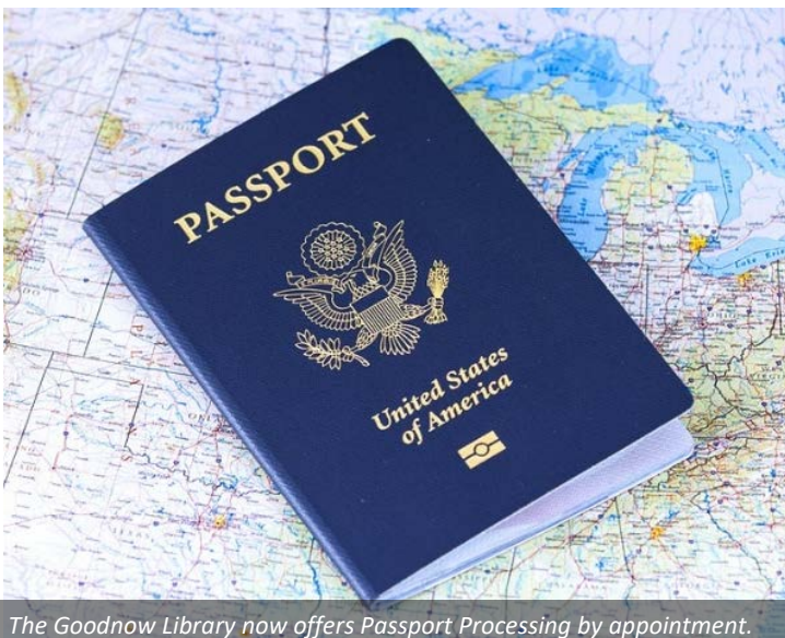
The Goodnow Library now offers Passport Processing by appointment.

Use your library card to discover the Universe from your own backyard! The Goodnow Library now has a telescope that is powerful enough to resolve the Rings of Saturn, the Galilean moons or nearby star clusters—and you can borrow it for free!