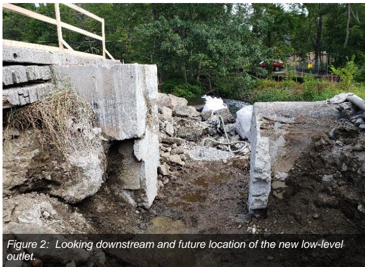
Figure 2: Looking downstream and future location of the new low-level outlet.

The 2019 Roadway Resurfacing program is now complete. Thank you to staff and contractors who worked to perform the work as efficiently as possible given a very rainy season, and thank you to residents for your patience during