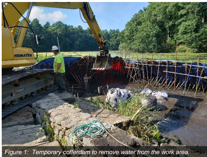
Figure 1: Temporary cofferdam to remove water from the work area.

and that the road surface improvements last for many years. For a complete list of the streets that were treated, please visit https://wp.me/p5uh9r-c8