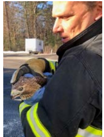
Firefighter Place holding the Red Tail Hawk he helped rescue (above). The hawk was released back into nature (below) after getting a clean bill of health from the veterinarian.