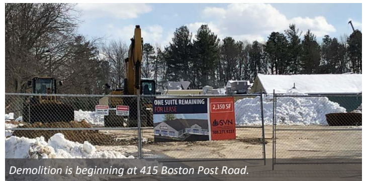
Demolition is beginning at 415 Boston Post Road.