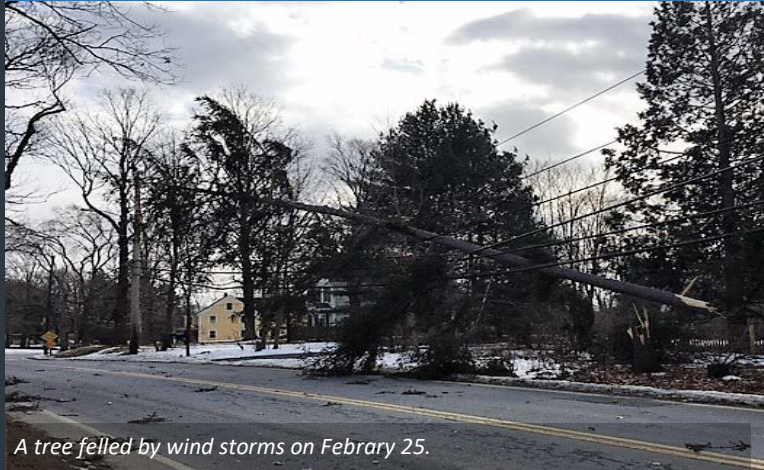
A tree felled by wind storms on February 25.