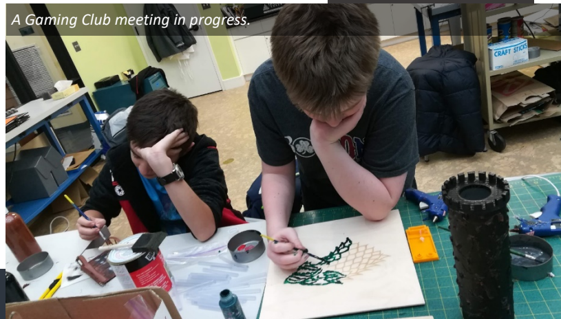
A Gaming Club meeting in progress.