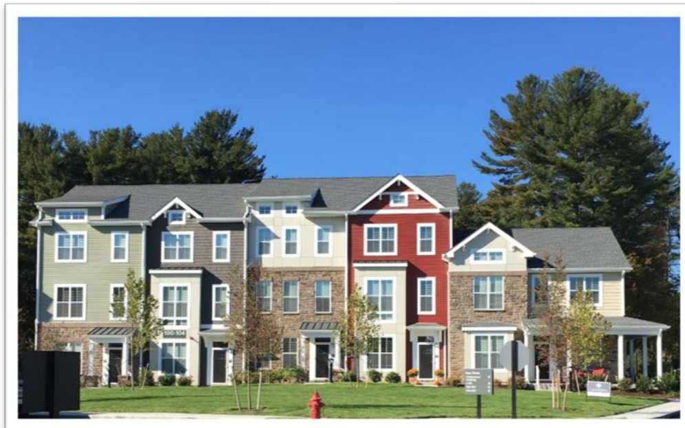
Multi-family housing at Avalon Bay.

Avalon has been moving quickly towards completion with 150 apartments that have a Certificate of Occupancy and 100 units left to go. They are hoping to complete the project by the end of March 2019.