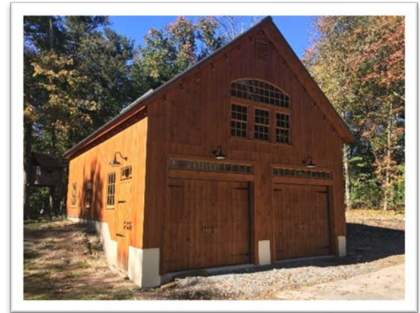
A newly built barn on Willis Road.

We have had three recent barn-style garages built in town. All three of these unattached barns have different styles of construction. Each is appealing in its own way and will serve the owners well.