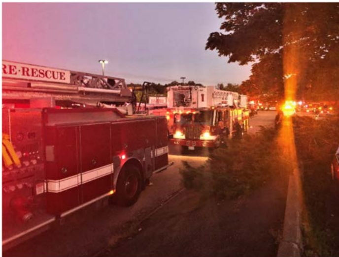
Sudbury Ladder 1 and Peabody Tower 1 in Staging during the response at Merrimack Valley.

On Thursday, September 13, 2018, Ladder 1 responded in mutual aid to the City of Lawrence due to an over pressurization of part of the City's natural gas system. Ladder 1 responded as part of the Fire Taskforce to supply five Engine Company's, two Ladder Company's and two Chief fire officers to assist with this disaster. On Sunday, September 16 th , Ladder 1 responded once again to the City of Lawrence to provide support. Sudbury is part of the State Fire Mobilization system that is set up to provide support when these types of disasters occur.