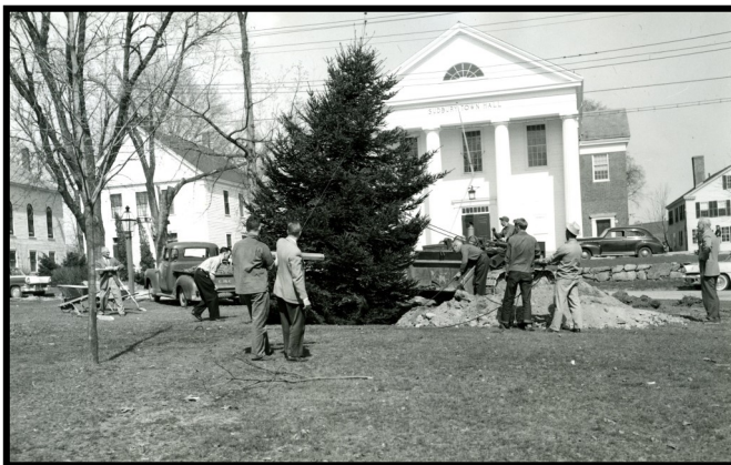
Sudbury Town Center c. 1950. Selectman Harvey Fairbank, along with other Sudbury residents, sets up a tree on the Town Common.