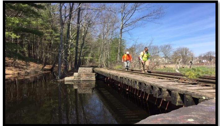
VHB wetland delineators accompanying Sudbury Conservation Commission members on wetland inspection.

The MBTA Right of Way (ROW) wetland delineation process was finalized and approved with significant revisions.