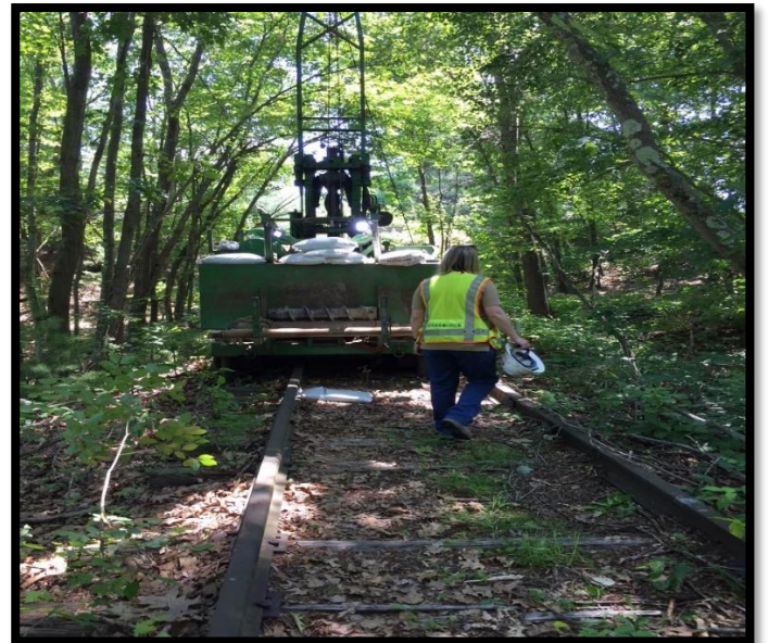
Soil boring drill rig as seen on MBTA ROW performing soil borings in Hudson June 2018.

Finally, the hearing for soil borings on the ROW by Eversource has been continued to August 20 at the Town Hall.