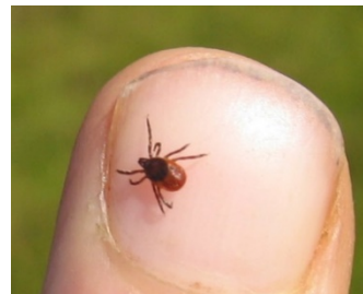
Actual size of a deer tick

Check out this on-line resource from the State Health Department for more information: http://blog.mass.gov/blog/health/the-importance-of-protecting-your-home-and-family-against-ticks-and-mosquitoes/ .