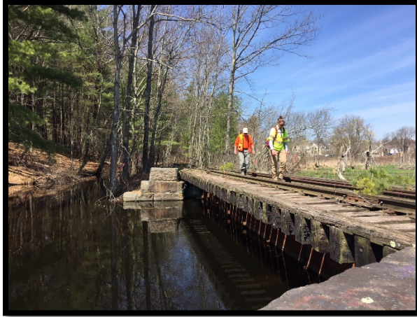
Eversource site work preparation.

The Department has held several Eversource hearings as well as resident applications, which required the addition of an extra meeting in May due to the number of wetland permit applications currently before the Commission.