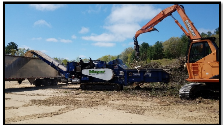
Town-wide removal of debris resulting from the winter storms that battered Sudbury this winter has wrapped up. Pictured above is the chipping of the debris that took place at the Melone property on Route 117.