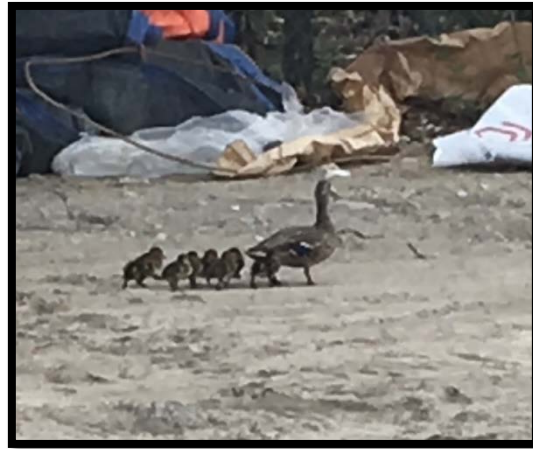
A family of ducks touring the Meadow Walk construction site.

Prospective tenants of the feathered variety have been checking out the pond between High Crest and Avalon Bay. A mother mallard duck escorts her seven ducklings carefully as they pass through the construction site.