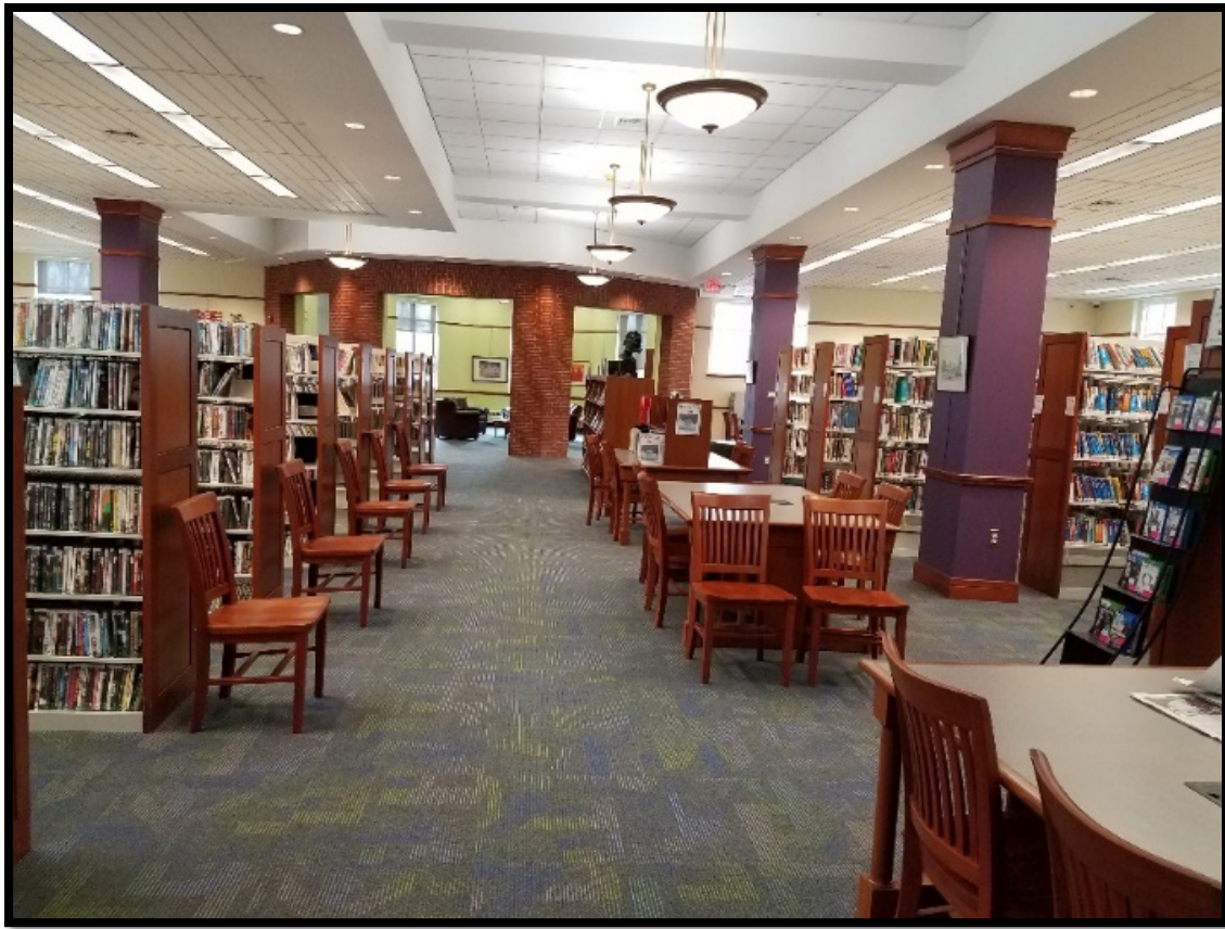
A View to the Non-Fiction stacks and the Newspaper Reading Room.