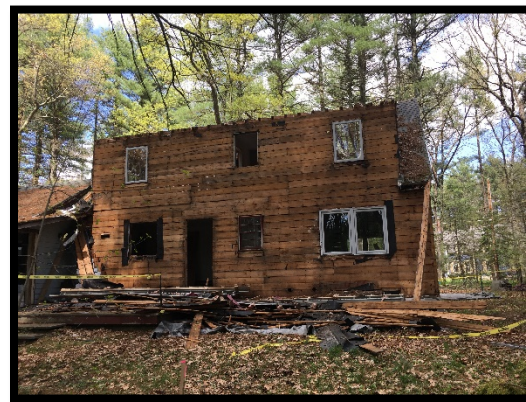
Above left and right: Eco-friendly demolition at New Bridge Road.