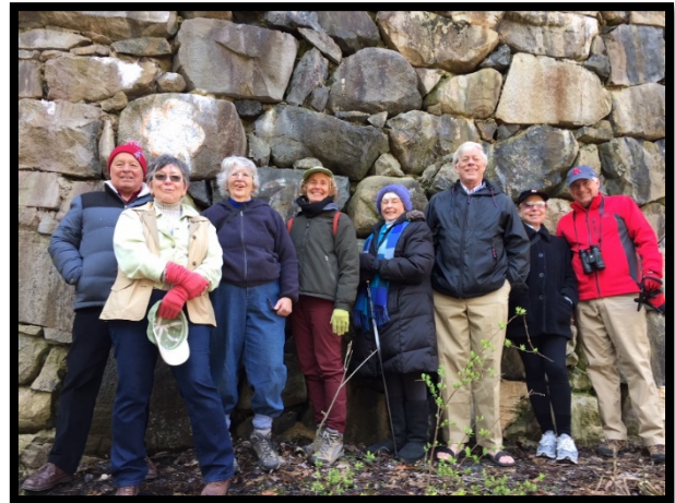
Spring Walk 2018 participants.

Our Spring Walks held in conjunction with L/S were well attended, with many expressing an interest in adding Fall Walks to our schedule.