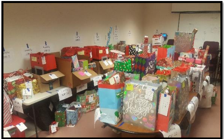
The Holiday Gift Program served over 100 Sudbury Resident this past December.