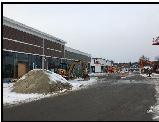
National Development's retail village starting to take shape.

We have had many inquiries about the old restaurant on North Road and hopefully it will see a new life soon.