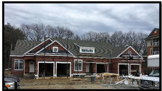
Three-Unit Condominium under construction at Northwoods.

We have received a few demolition applications for existing homes to make way for new housing. There is also activity on a few lots throughout town. Several are in planning and engineering stages and soon hope to be under construction. The Northwood Drive condominiums have started construction with the newly designed units. The first building has been framed and a permit application for a second has been submitted to the Building Department.