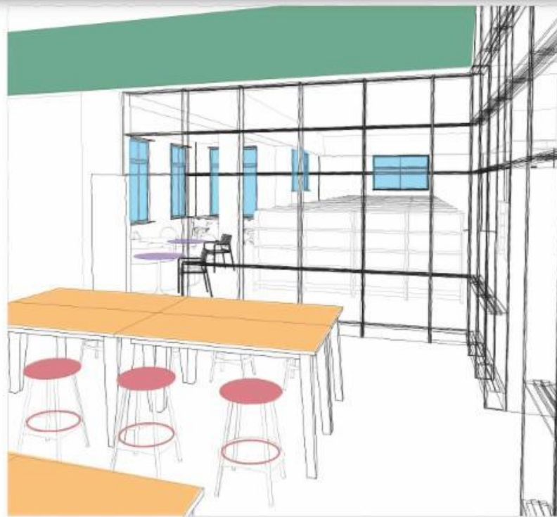
The NOW Lab • View from the NOW Lab towards new teen area

We hope that when you see the NEW second floor, you will agree that these temporary inconveniences were worth it!