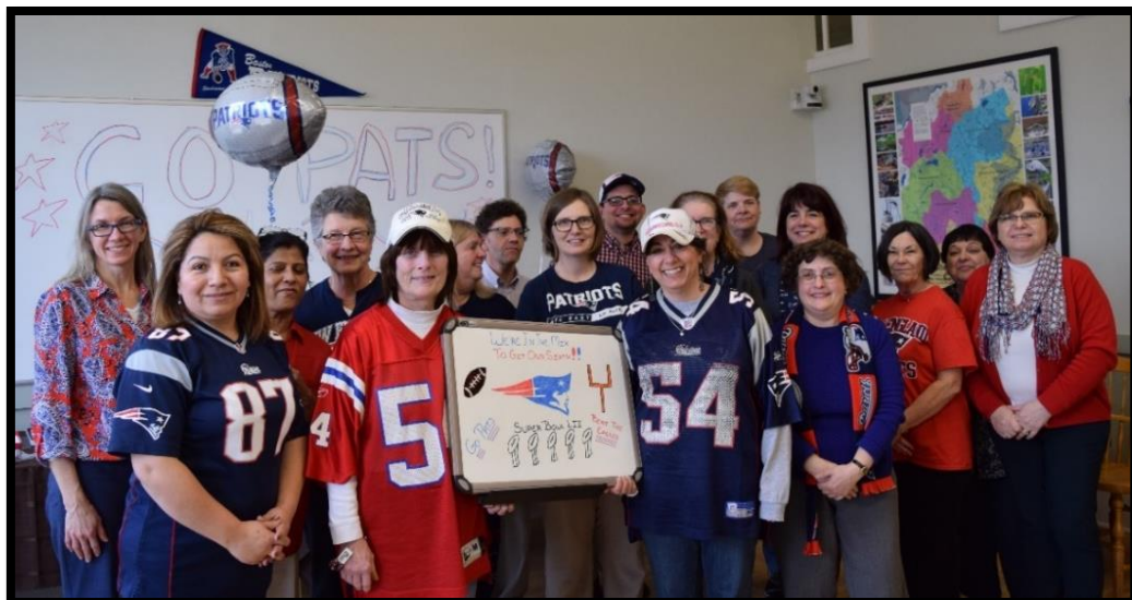
Town staff showing their Patriots Pride on Thursday, February 1, 2018.

Please note: The above description reflects some of the agenda items discussed at recent Board meetings. For further meeting details, please go to SudburyTV.org to replay the meeting or view the Board of Selectmen meeting minutes, found at: https://www.sudbury.ma.us/boardofselectmen/meetings/