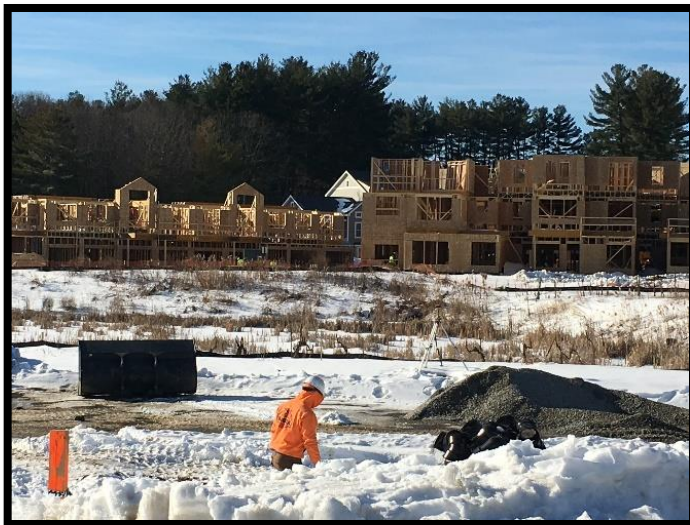
Work progressing at Avalon Bay in spite of a snowy winter.

Avalon Bay, The Bridges and Highcrest are hoping to start occupying this summer. National Development retail village is starting to lease out space, as we have issued the first permit for a tenant fit up for the Oak Barrel Tavern in building four.