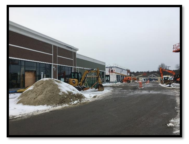
National Development's retail village starting to take shape.