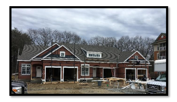
Three-Unit Condominium under construction at Northwoods.

We have received a few demolition applications for existing homes to make way for new housing. There is also activity on a few lots throughout town. Several are in planning and engineering stages and soon hope to be under construction. The Northwood Drive condominiums have started construction with the newly designed units. The first building has been framed and a permit application for a second has been submitted to the Building Department.