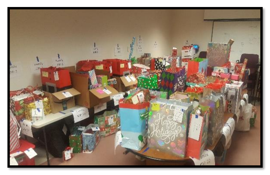
The Holiday Gift Program served over 100 Sudbury Resident this past December.

Donation Program. This program matched families in need in Sudbury with donors in the