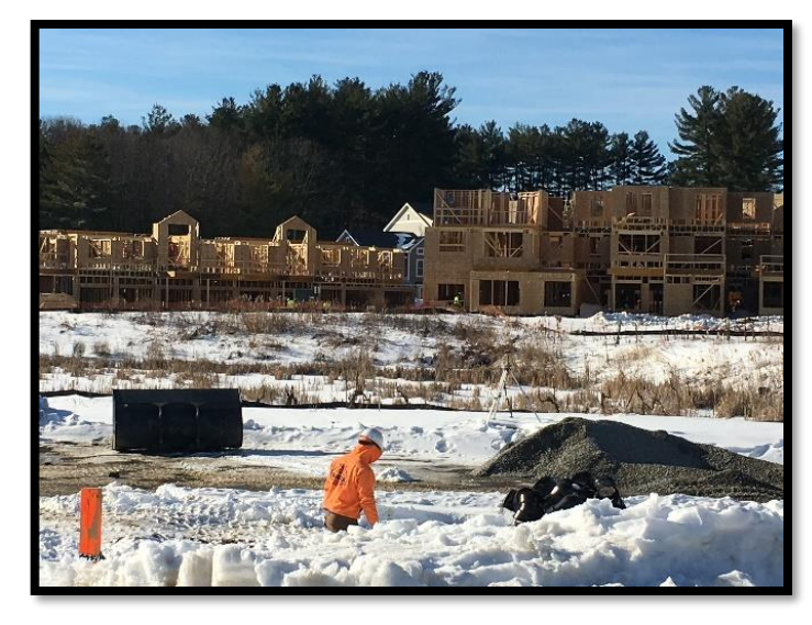
Work progressing at Avalon Bay in spite of a snowy winter.

Avalon Bay, The Bridges and Highcrest are hoping to start occupying this summer. National Development retail village is starting to lease out space, as we have issued the first permit for a tenant fit up for the Oak Barrel Tavern in building four.