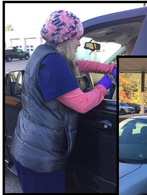
38 flu shots administered during the drive-through flu shot clinic.