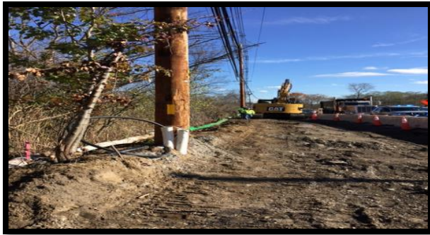
Route 20 widening and drainage work area. (11/9/17)

The Conservation Commission was extremely busy this fall. We have continued to evaluate projects, set appropriate conditions to protect regulated natural resources, and generate permits, for all of our projects taking place in Town. We are working with our Environmental Monitor, David Burke, to oversee the environmental matters at Meadow Walk as it progresses. Weekly site inspections are being administered, along with additional inspections following large rain events.