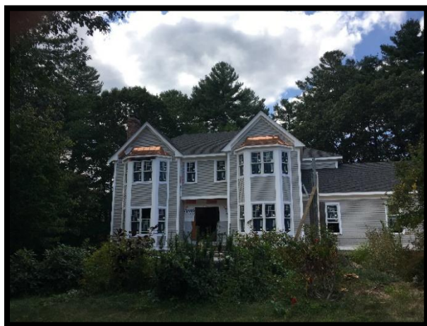
Reconstruction at Whitetail Lane