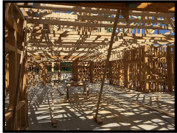
Future site of Bridges by Epoch Memory Care Assisted Living

The Whole Foods Market is complete, and the four retail buildings have foundations in place and will be erecting a steel frame this month. The Bridges Assisted Living building has the foundation and rough plumbing done. They have started to frame the building and appear to be moving right along. Avalon is starting construction and they plan to work straight through to completion. Work has just started on the Waste Water Treatment plant with the anticipation of increased water flow once the other buildings begin to be occupied. High Crest, the over 55 condominium development, has started to submit permits.