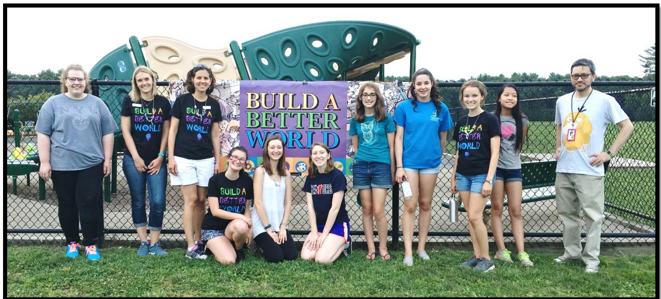
Staff & volunteers at the Kids Summer Reading end of summer party

Summer Reading and collectively read over 7,300 hours this summer – WOW! In addition to the reading incentive program, the Friends of the Library also sponsored many fun programs. Kids enjoyed watching a live animal show, a science show, building egg drop protectors, water bottle rockets, and more! Kids also got the opportunity to participate in service projects for a community supper, troops overseas, and a local animal shelter as part of the "Build a Better World" theme.