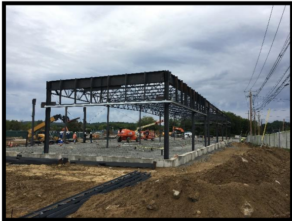
Future site of 534 Boston Post Road, retail space at Meadow Walk