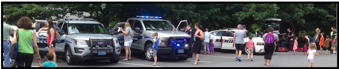
Above: Visitors learning about safety vehicles during this year's Truck Day.