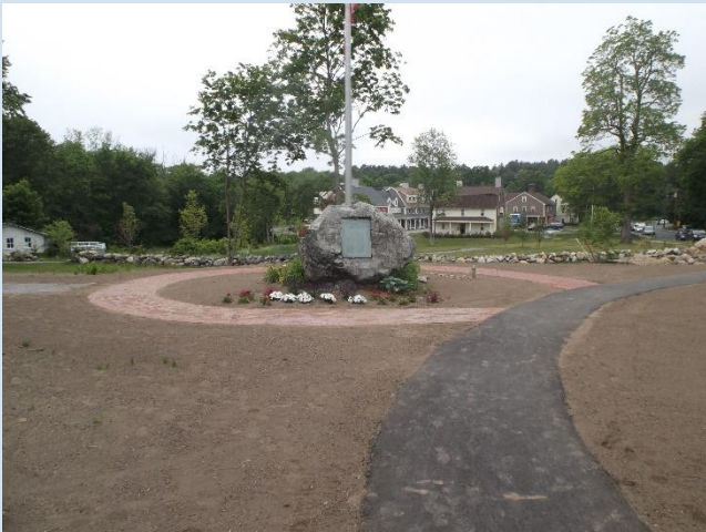
Above: Improvements at Grinnell Park include the addition of a brick walkway around the monument.