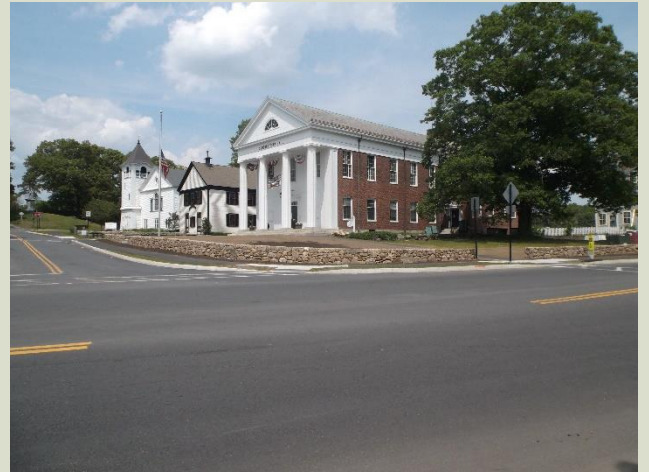
Above: Improvements around Town Hall include refurbishment of the stone wall.