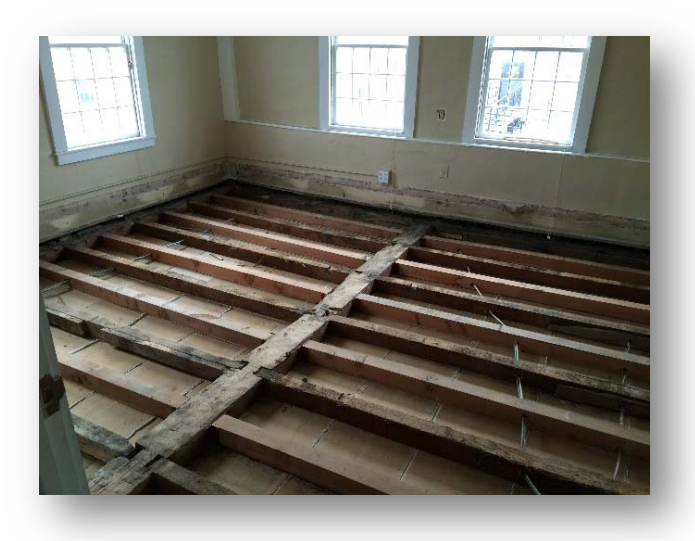
Shown Above and Below: The Loring Parsonage structural upgrades in progress.

These pictures are taken from the inside of the Loring Parsonage. The Parsonage is undergoing structural upgrades and the contractor has begun to reframe the floor structure, bringing the building into compliance with current floor loads. At May's Annual Town Meeting, voters approved funds to repurpose the town-owned Loring Parsonage into a History Center and Museum. The design phase and structural modifications are currently underway with funds provided by the state. Restoration of the Parsonage will protect a town asset, constructed in 1730, from further deterioration, and preserve its architectural integrity. The Historical Society intends to use the building as a History Center and Museum, to include display of historic documents and artifacts, provide educational resources for Sudbury schools and opportunities for research and study of historic objects and documents, and as a welcome center for tourists.