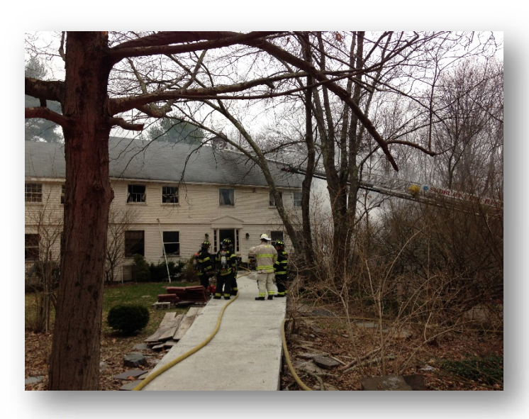
Above: Firefighters responding to the fire at Greenhill Road

fire with a large 2 ½ inch hose line to get the fire under control. The Sudbury Public Safety Dispatchers and the Sudbury Police also did a great job helping with this incident. We received mutual aid assistance at the fire from the Wayland, Marlboro, and Framingham Fire Departments. Coverage for our three fire stations was provided by Maynard, Concord, and Weston.