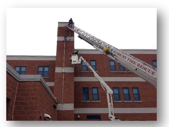
Shown Above and Below: Antenna installation at Curtis Middle School.

boxes from the old copper wired style to a new version that works by radio waves. This will allow us to remove many miles of copper wire from the utility poles and also be relieved of the associated maintenance costs. When activated, the new style box sends a radio signal to