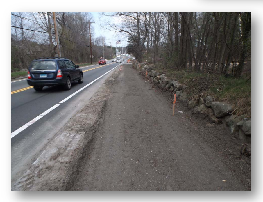
Shown Above and Left: Route 20 walkway construction.