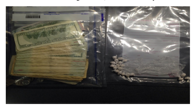
Shown above: Items seized at May 2 arrest.

We would like to thank the concerned citizen who made it possible to make the arrest while removing the heroin from the streets and remind others to report suspicious circumstances as you never know what might result, even in Sudbury.