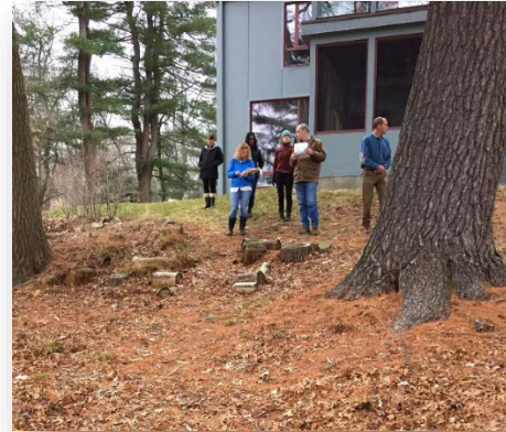
Above: Commissioners conducting a site inspection on the site of an upcoming wetlands permit hearing.

As always, should you have any questions, please feel free to contact the office via email Concom@sudbury.ma.us or 978 440 5472.