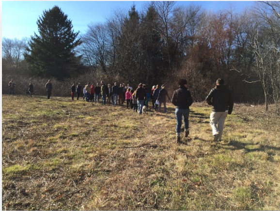
Shown Above and Previous Page: Walkers enjoying a tour of Landham Brook Marsh.