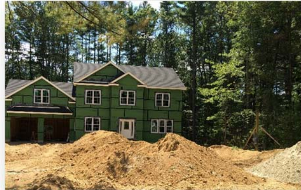
505 Hudson Road: Removed as it was not a candidate for preservation