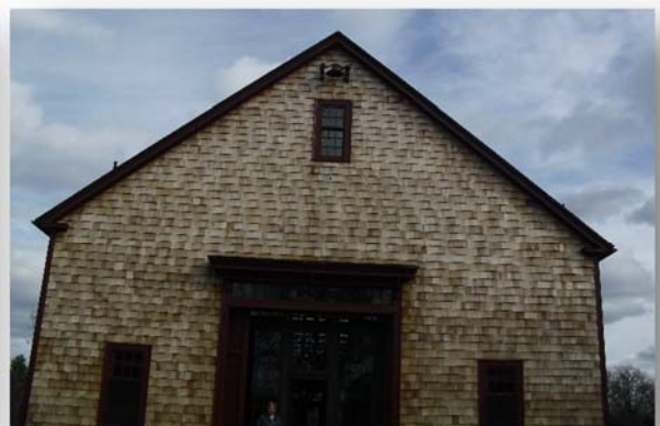
30 Rice Road: Renovated to preserve historic appearance