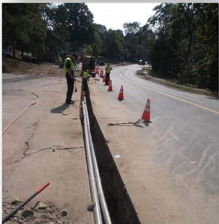
Pictured Above: The last of the drainage being installed at Town Center Below: Two conduits being installed for the fire alarm system at Town Center