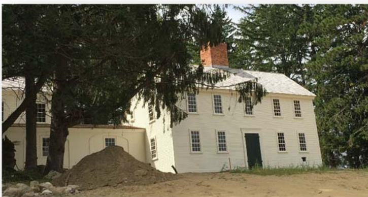
667 Concord Road: Relocated and preserved, inside and out