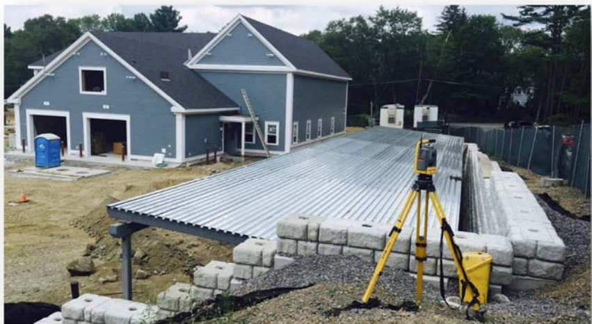
Pictured Right: View of carport from the rear.