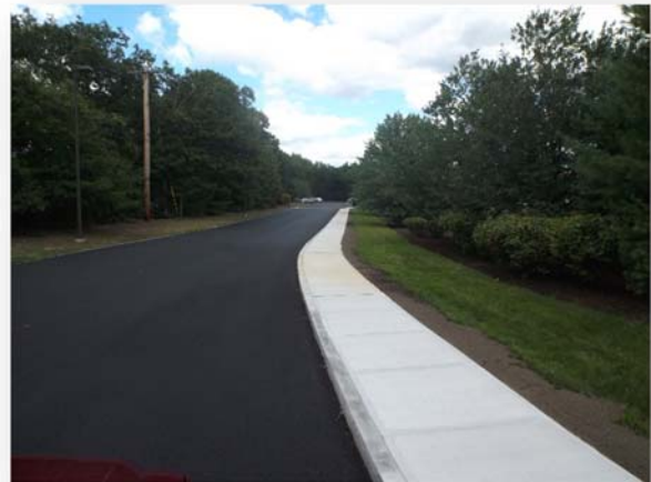
Pictured Above: Walkway construction completed at Curtis Middle School