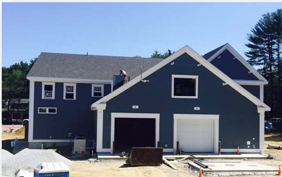
Pictured Above: Exterior of the new Police Station, photographed in September 2015.

advantage of the nice summer weather. The project is on schedule and it is anticipated that we will begin to move furniture and equipment into the new station in November.