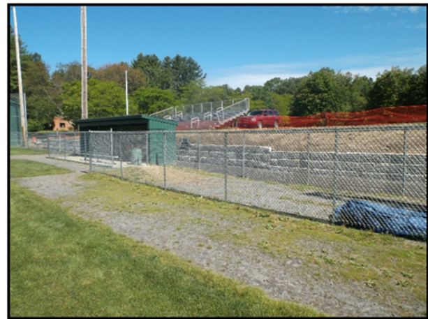
Feeley Field retaining wall

Drainage installation has begun on the town center, outfall to the Heritage Park Pond, drainage in Old Sudbury road and drainage along the No-Name Street has been completed. We are still anticipating a September first completion date.