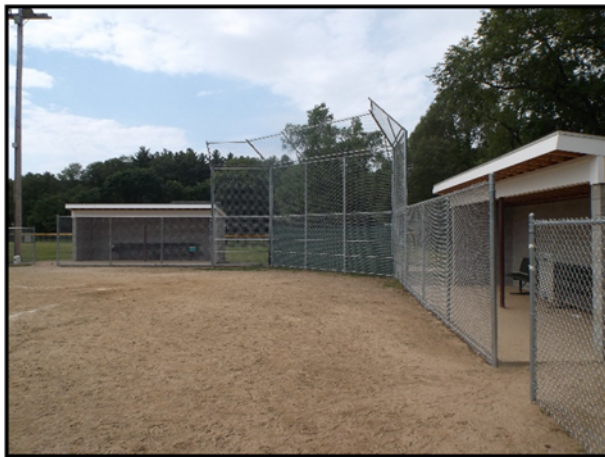
Featherland Park improvements

This past spring, the softball field at Featherland Park saw new upgrades including a Bull Pen, Dugouts, Backstop and new fencing (below left), courtesy of Sudbury Little League. A retaining wall at Feeley Field has been added which will allow access to the visiting team dugout (below right).