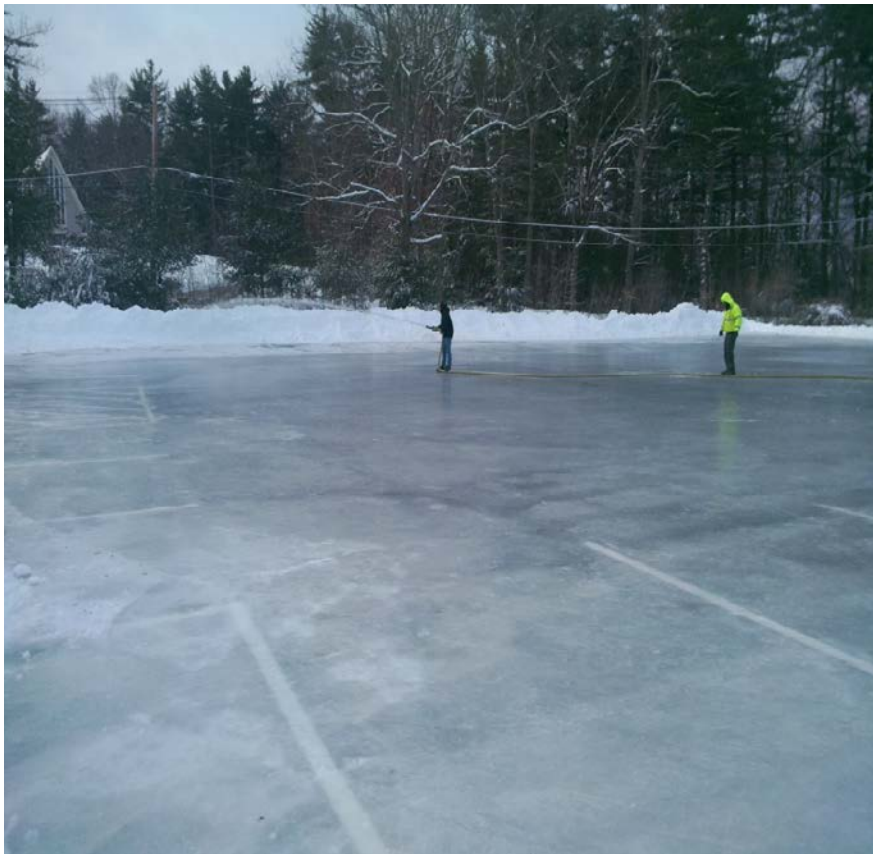
Skating At Featherland

The Town has received over 67 inches of snow this winter and still counting. The snow and ice budget is in a deficit by over $400,000. As bad as the winter has been, this year has been the best year in a long time for ice at the skating rink located at Featherland Park.