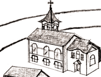
Presbyterian Church of Sudbury

Featherland Park & Nixon Elementary School