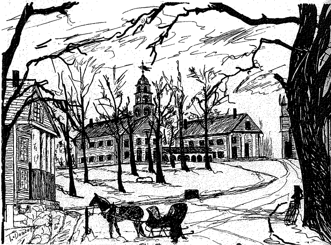
19th CENTURY SUDBURY COMMON