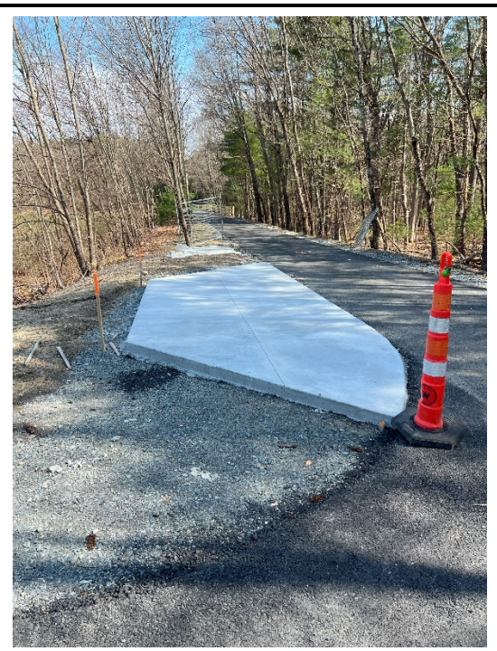
Photo 6: Sta. 184+50 looking north at the concrete rest area and the concrete pad for future art installation.