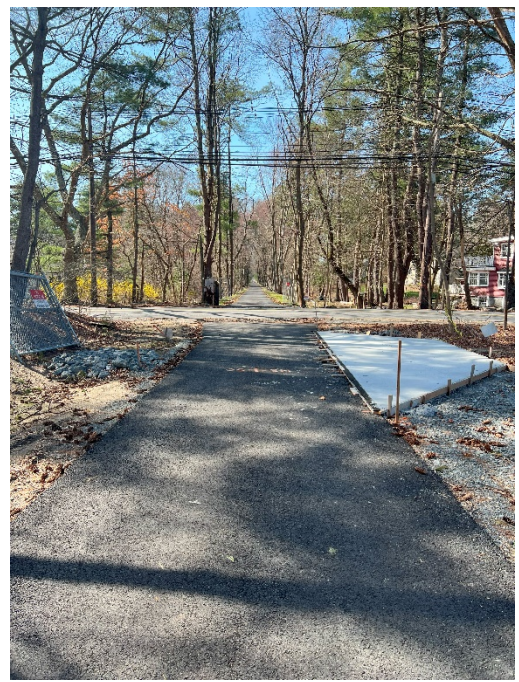
Photo 3: Sta. 144+00 looking south towards Old Lancaster Road and the proposed rest area.