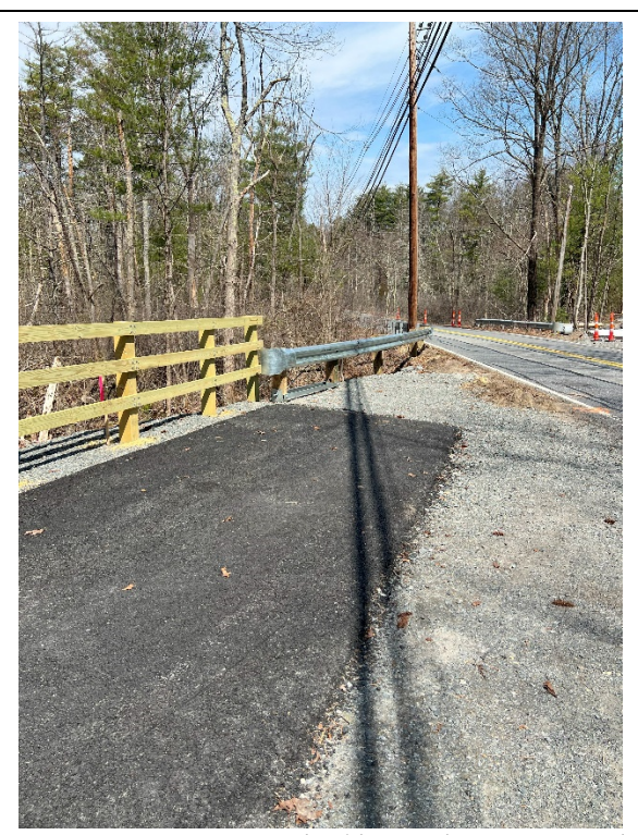
Photo 11: Sta. 284+00 looking at the constructed fencing and guardrail.