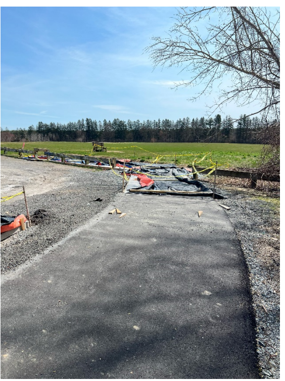
Photo 14: Sta. 1107+00 looking at the rest area at the end of the Davis Field spur path.