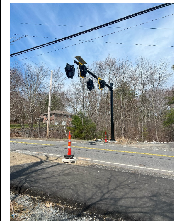
Photo 13: Sta. 307+50 looking at the HAWK signal above North Road.