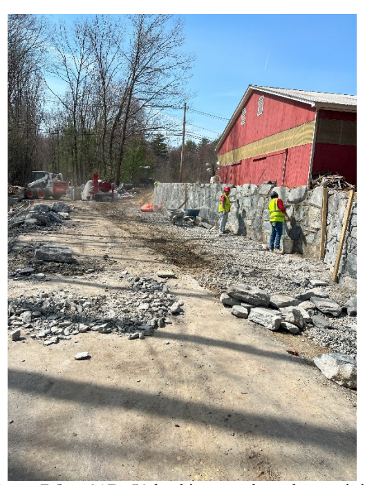
Photo 7 : Sta. 217+50 looking south at the retaining wall construction for the Morse Rd rest area.