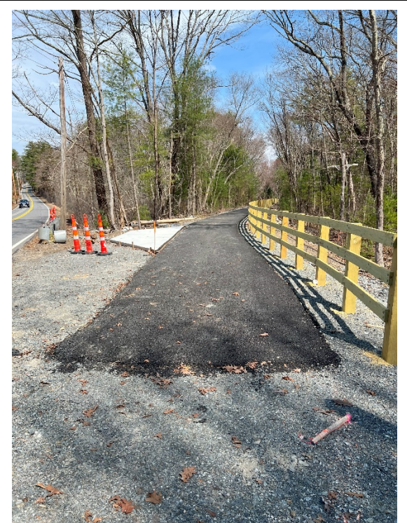
Photo 12: Sta. 284+50 looking at the fencing and concrete rest area north of Pantry Road