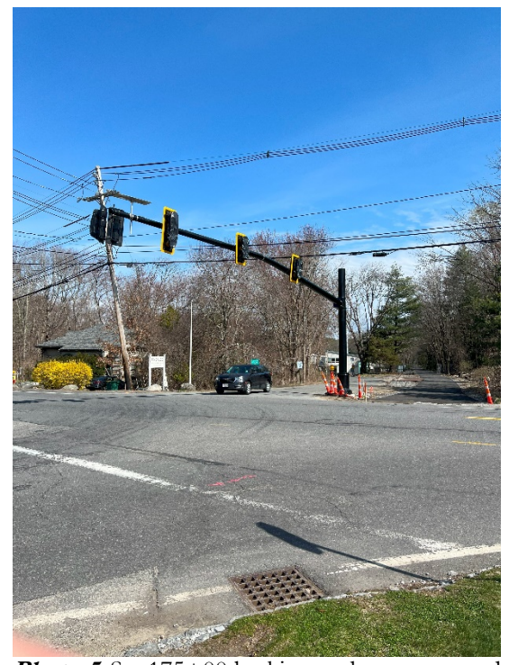
Photo 5 : Sta 175+00 looking at the constructed traffic signal over Hudson Road.