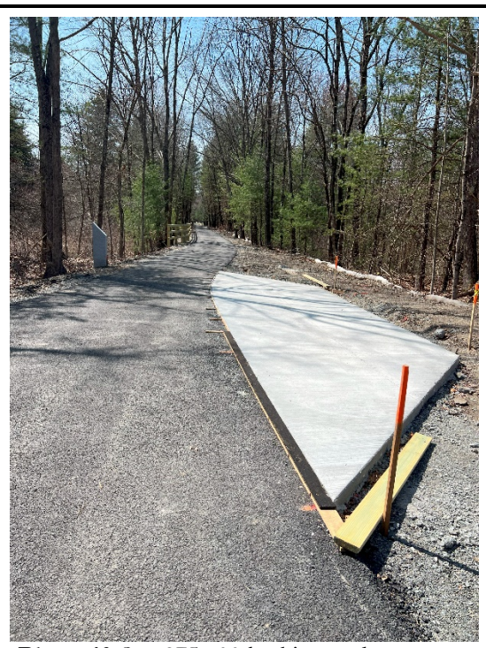
Photo 10: Sta. 275+00 looking at the rest area south of Haynes Road.