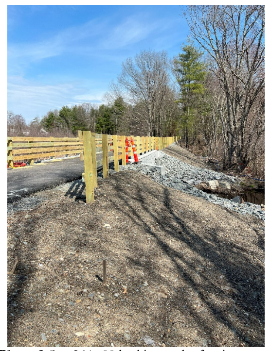
Photo 9: Sta. 264+00 looking at the fencing across the Pantry Brook bridge.