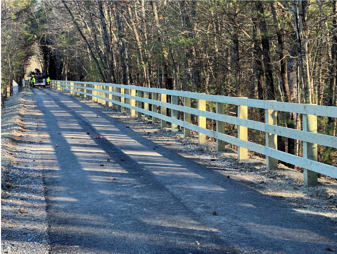
Cattle Crossing Fencing