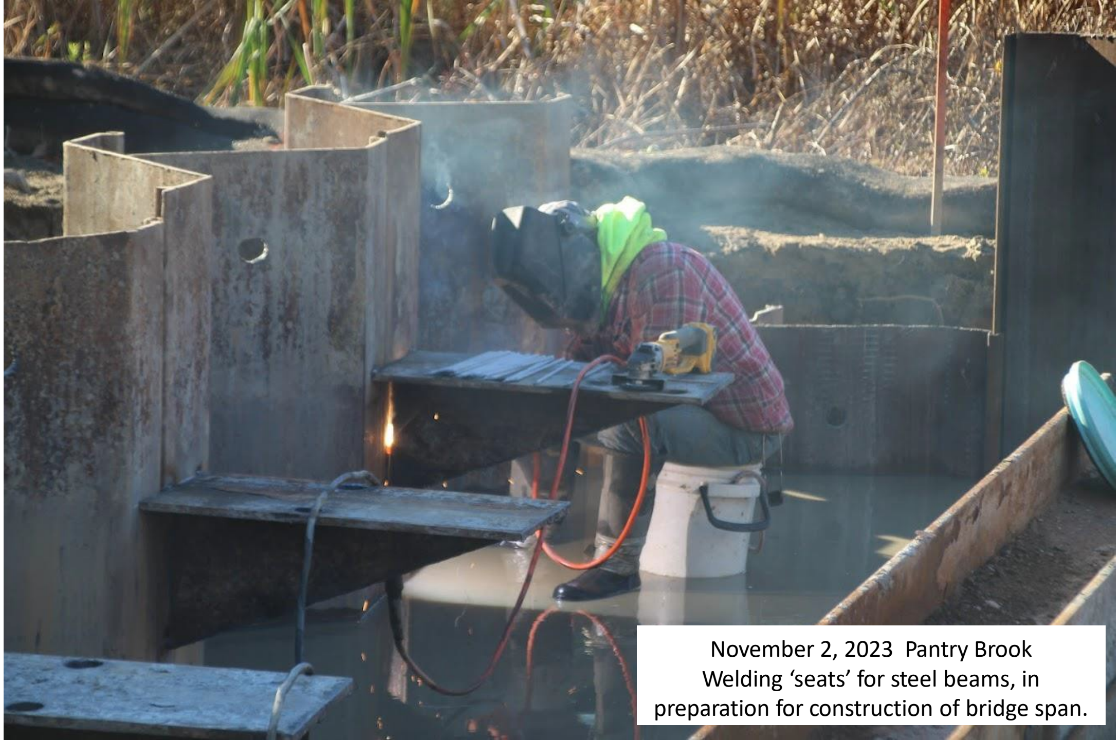
November 2, 2023 Pantry Brook Welding 'seats' for steel beams, in preparation for construction of bridge span.