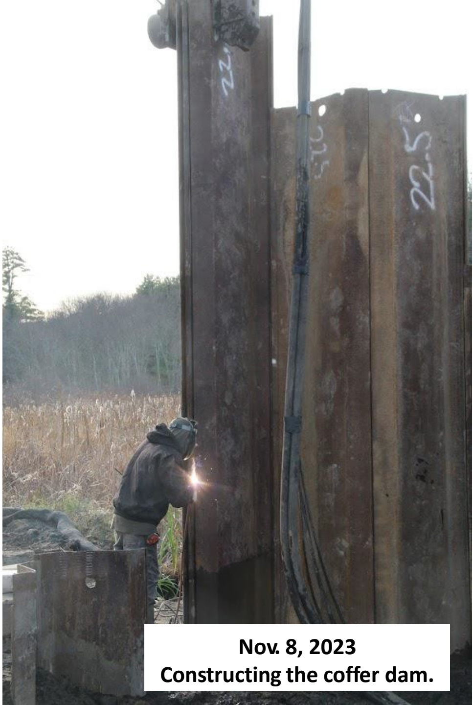
Nov. 8, 2023 Constructing the coffer dam.