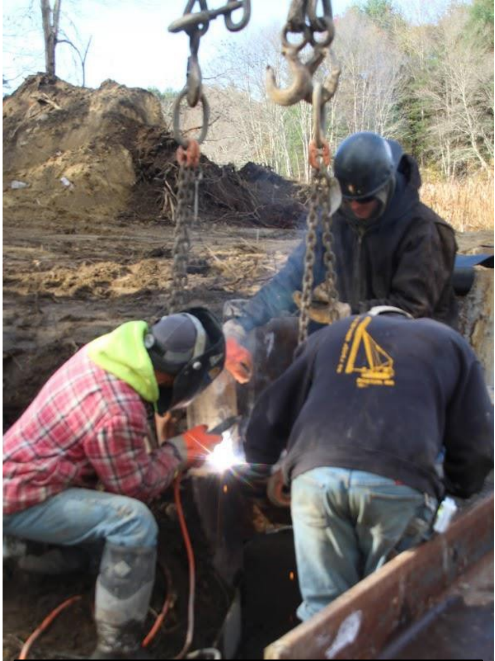
November 2, 2023 Fabricating steel for coffer dam and bridge.