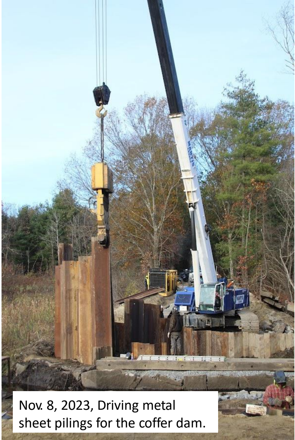
Nov. 8, 2023, Driving metal sheet pilings for the coffer dam.