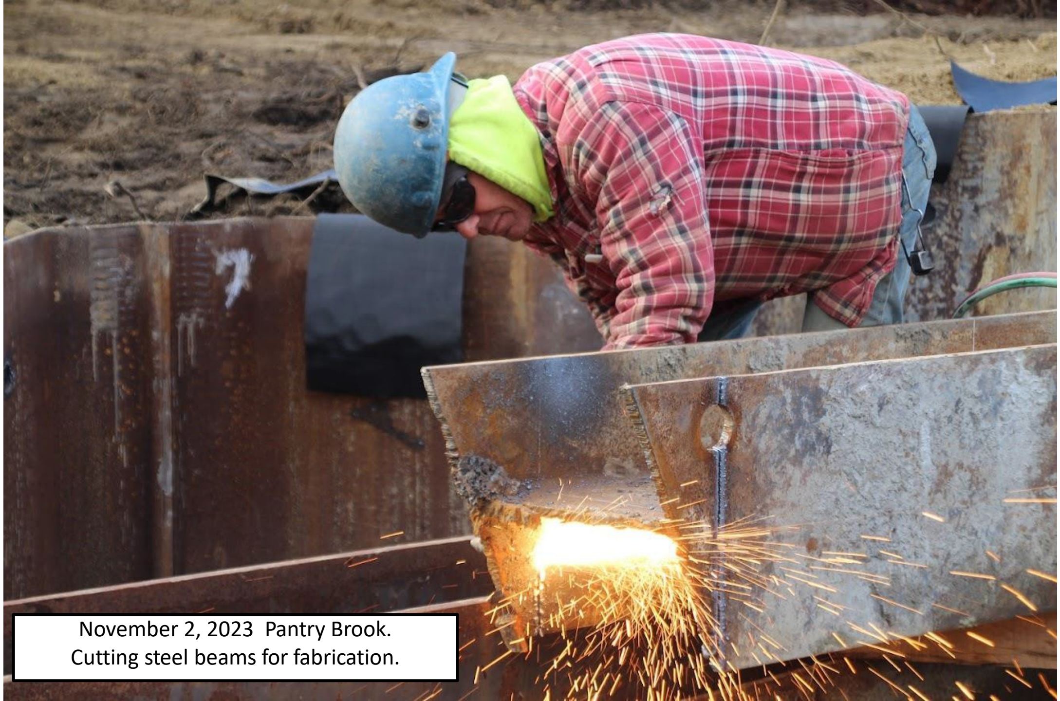
November 2, 2023 Pantry Brook. Cutting steel beams for fabrication.