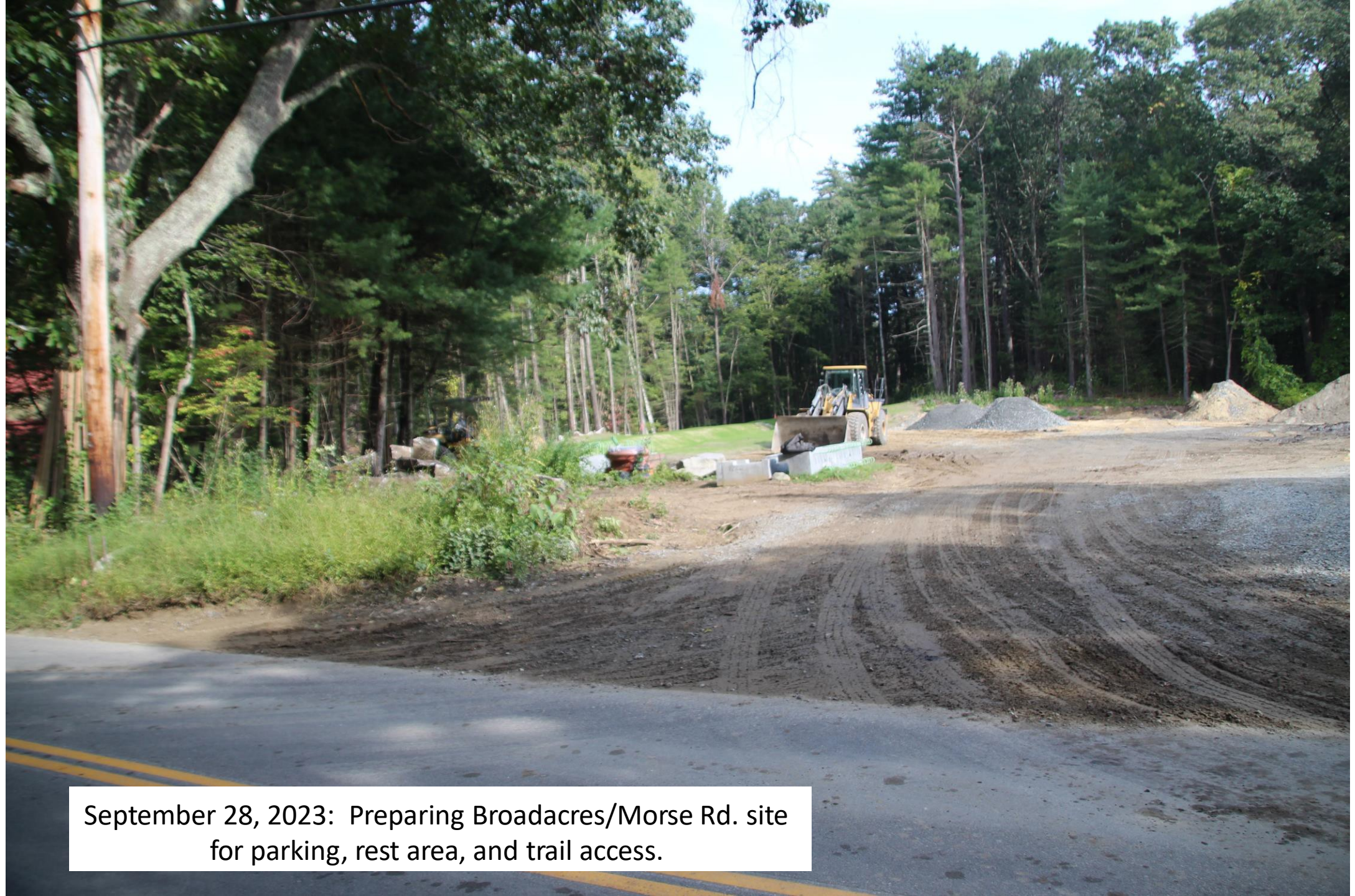
September 28, 2023: Preparing Broadacres/Morse Rd. site for parking, rest area, and trail access.