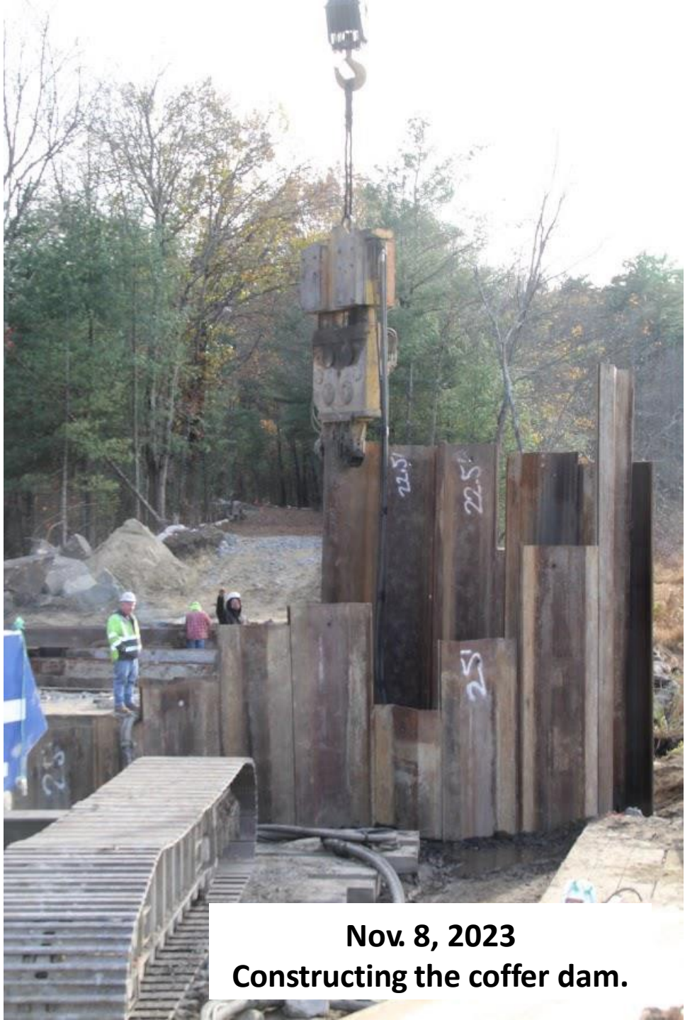
Nov. 8, 2023 Constructing the coffer dam.