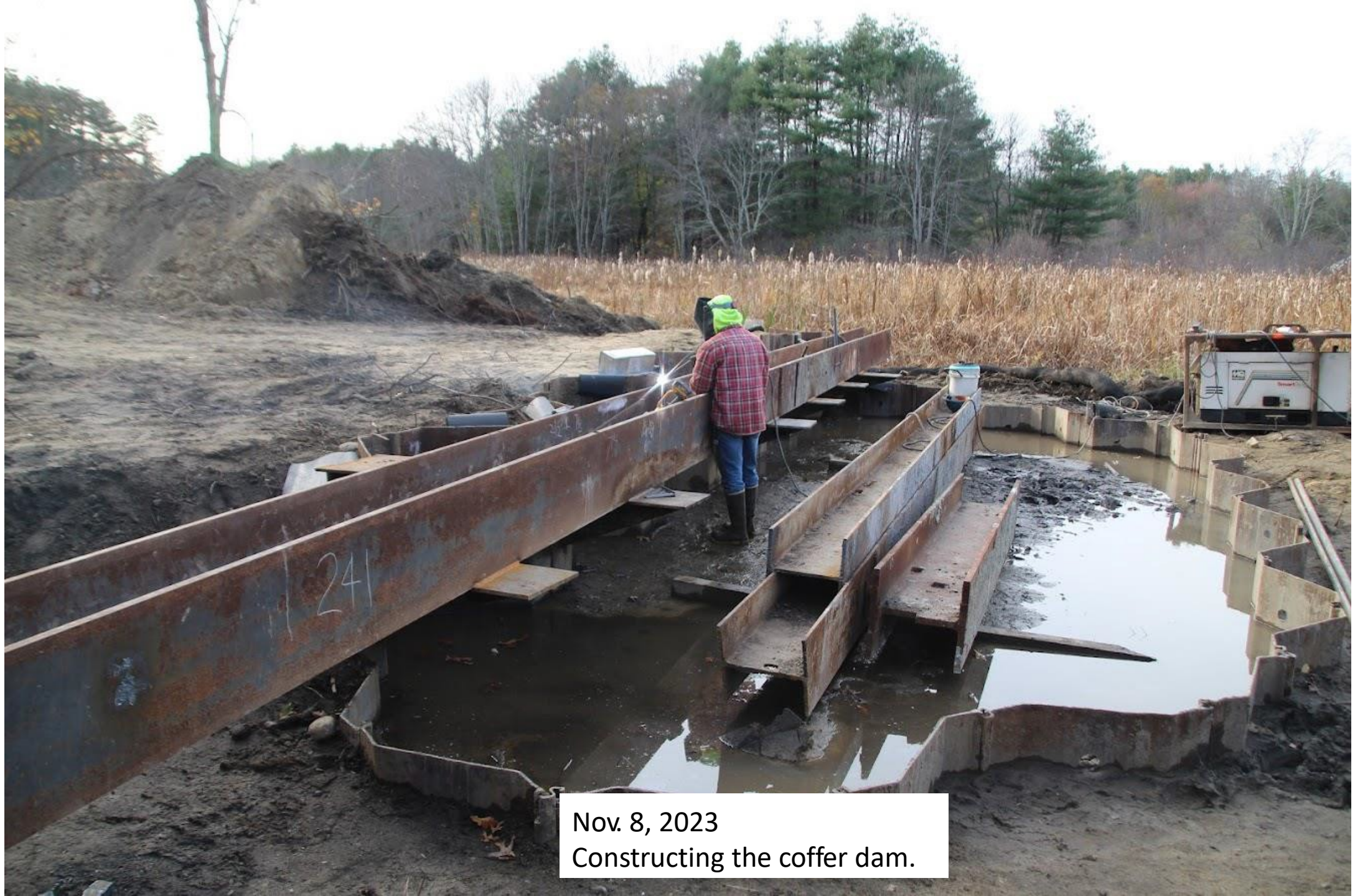
Nov. 8, 2023 Constructing the coffer dam.