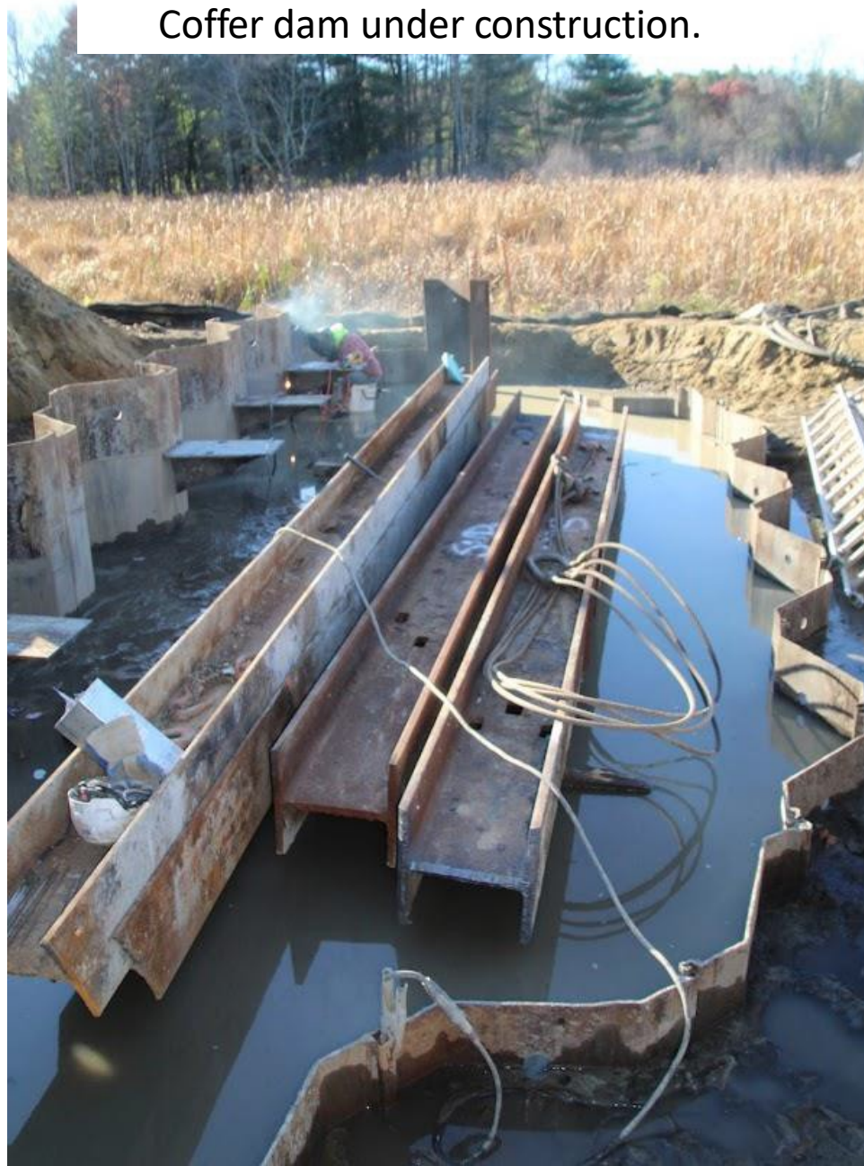
November 2, 2023 Pantry Brook Coffer dam under construction.