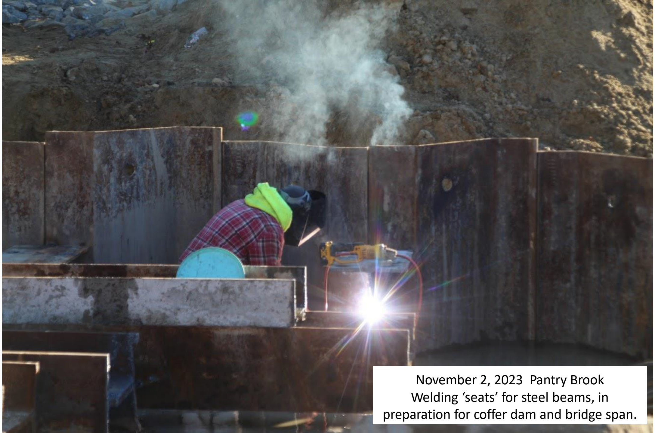
November 2, 2023 Pantry Brook Welding 'seats' for steel beams, in preparation for coffer dam and bridge span.