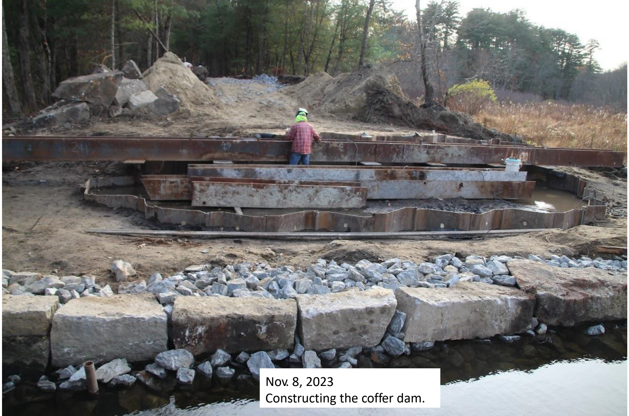
Nov. 8, 2023 Constructing the coffer dam.