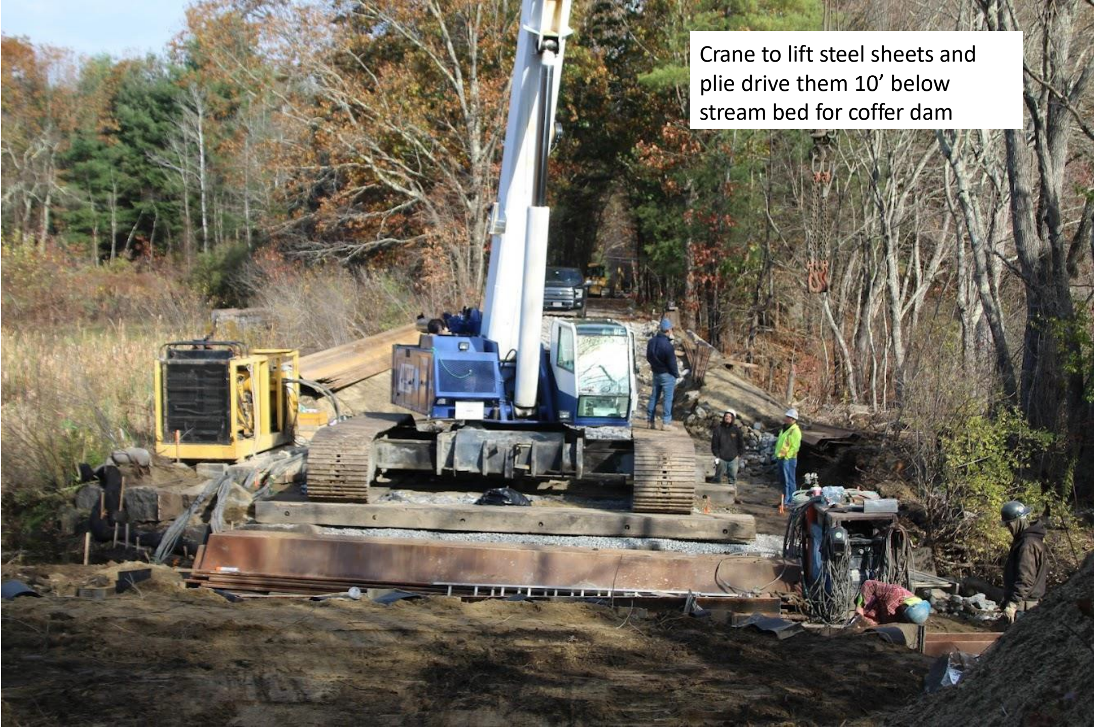
Crane to lift steel sheets and plie drive them 10' below stream bed for coffer dam