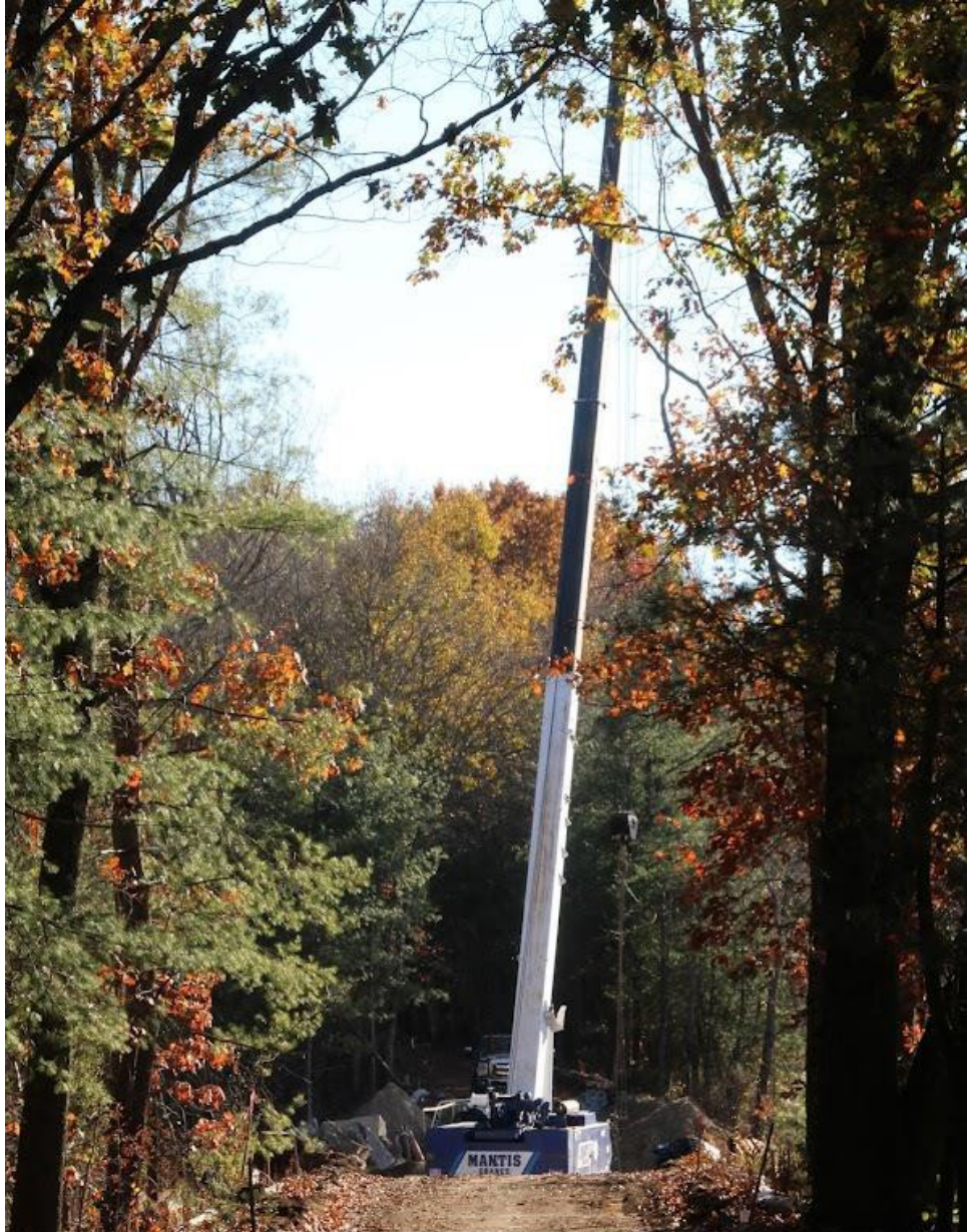
November 2, 2023 Looking south on BFRT toward Pantry Brook. Construction of coffer dam in preparation for bridge span.