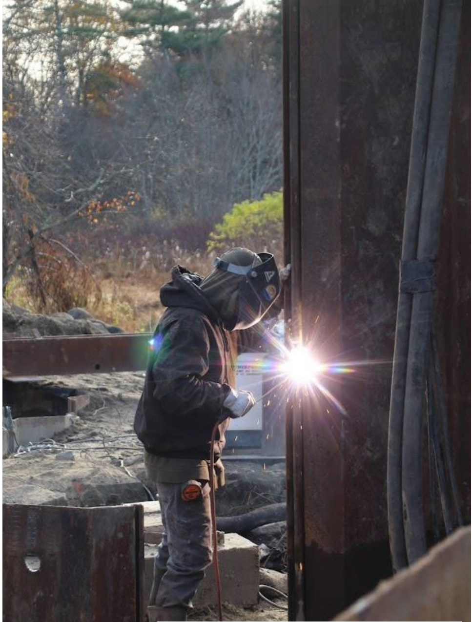
Nov. 8, 2023 Constructing the coffer dam.