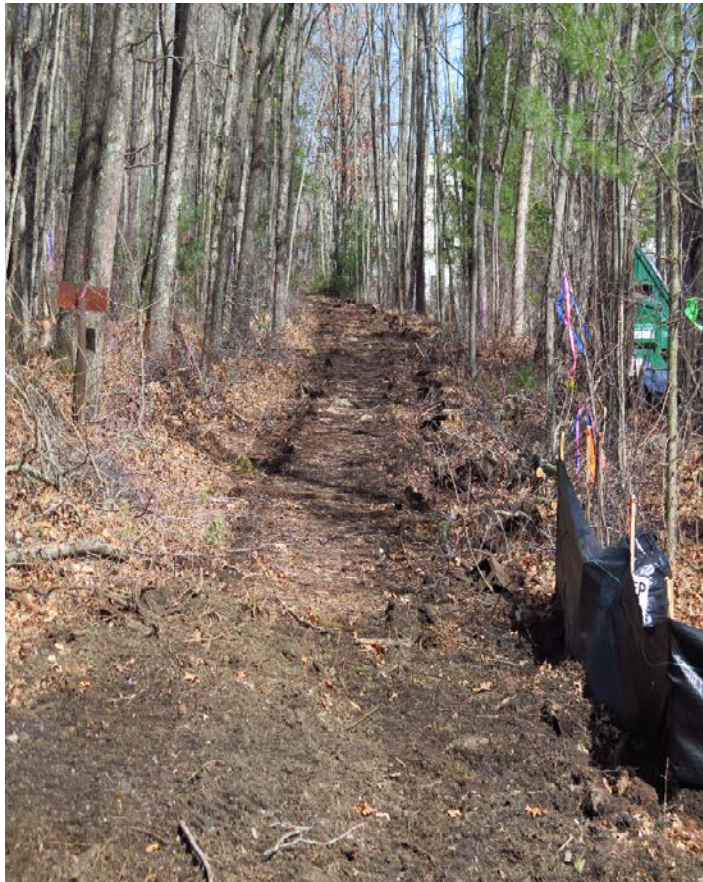
Rails Removed North of Diamond