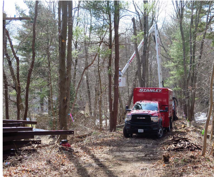
Old Lancaster Road Tree Removal