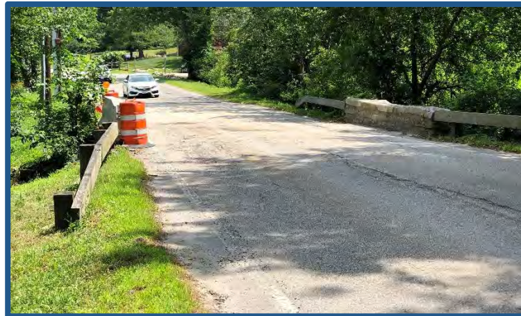
Temporary barriers in place of missing parapet