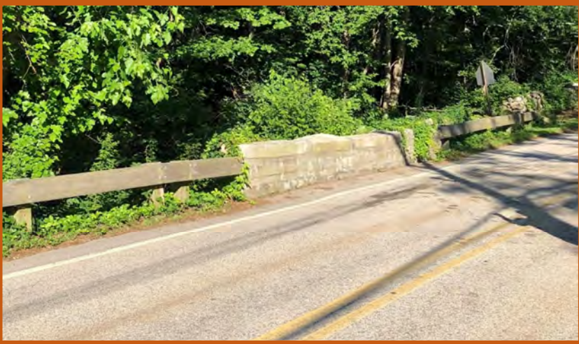
Above Photo: Street view of Wayside Inn Road Bridge Left Photo: Wayside Inn Road Bridge Parapet and Guardrail