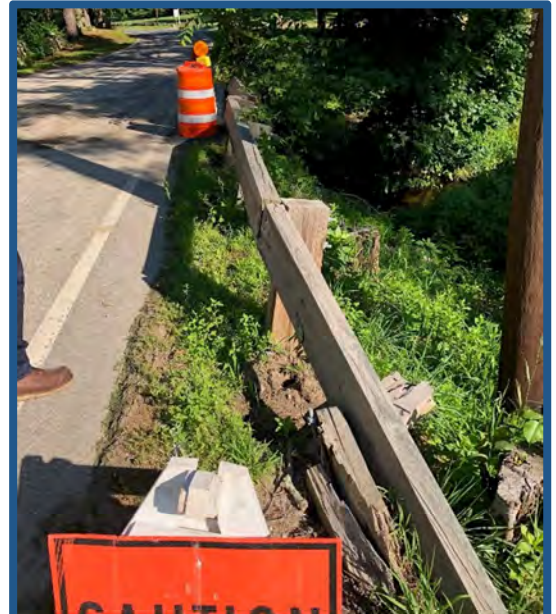
Broken sections of wood guardrail