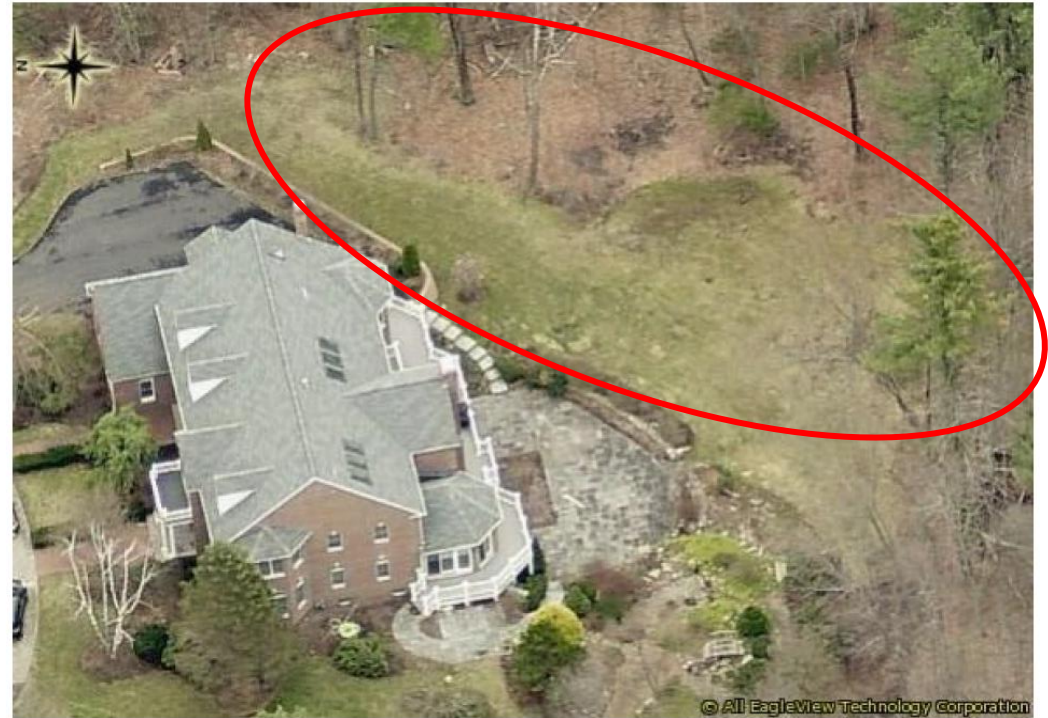
Condition of rear yard, area of concern, April 18, 2019 showing encroachment on resource area.

(Aerial Photographs provided by Town of Sudbury)