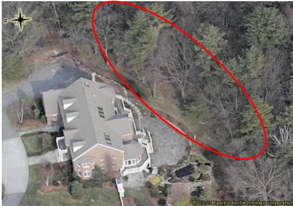
Condition of rear yard, area of concern, April 18, 2003