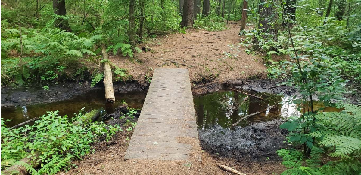
Fig. 2. Proposed project area in Gray Reservation. Same orientation as sketch (i.e. far bank is south).