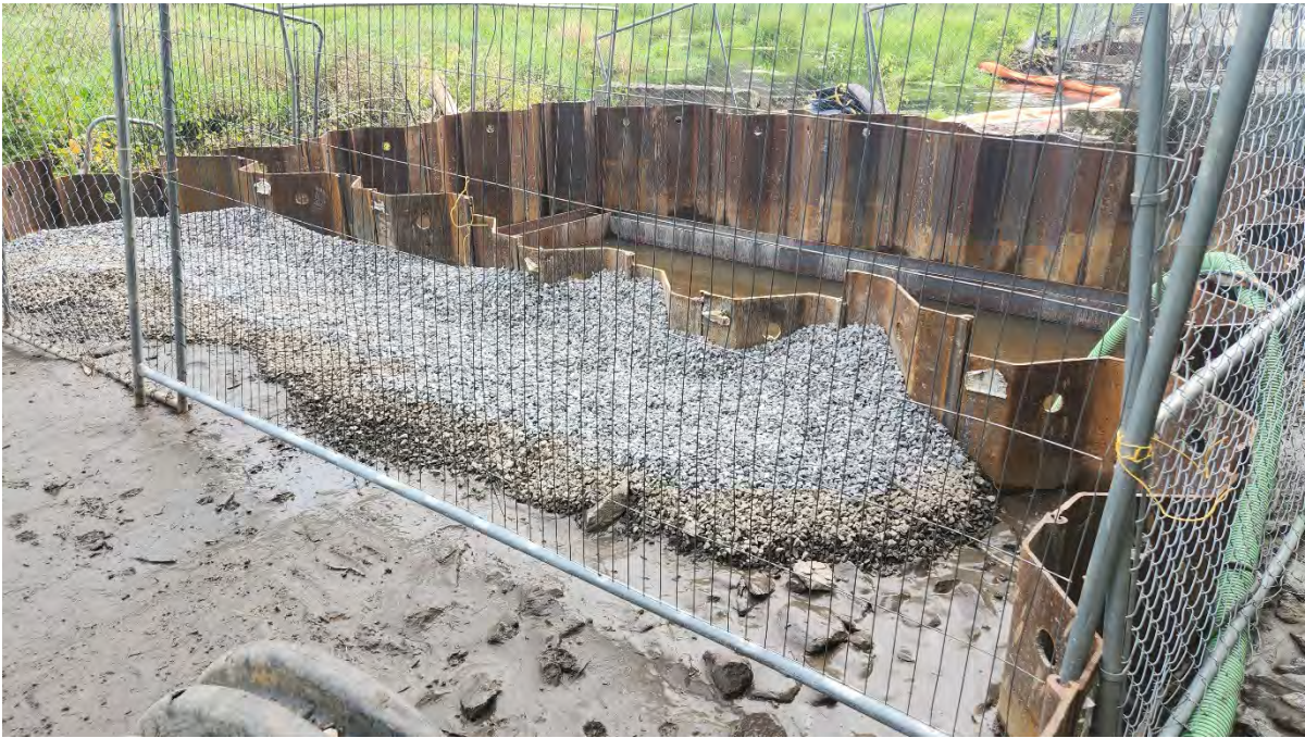
Photo 6: Bridge 127 removed and walers installed at segment 13/14. Photo taken on 8/21/23