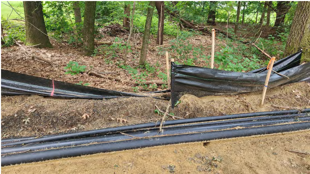
Photo 1: Broken stake in the silt fence along segment 10. Photo taken on 8/21/23