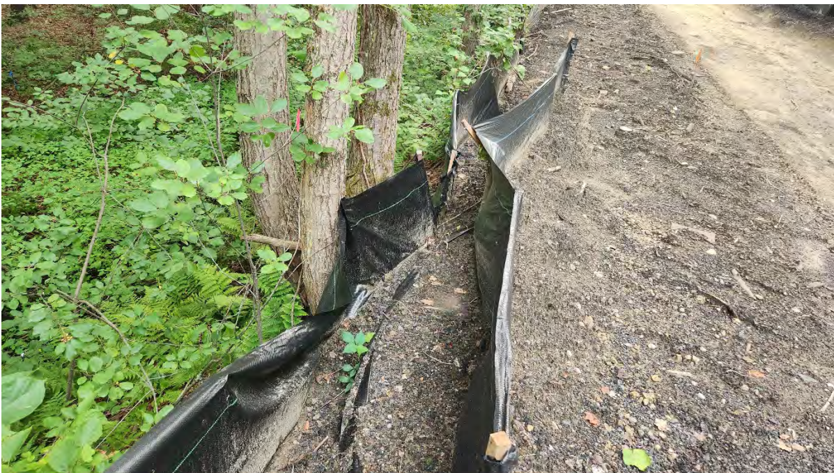
Photo 3: Broken stake in the silt fence along segment 11. Photo taken on 8/21/23