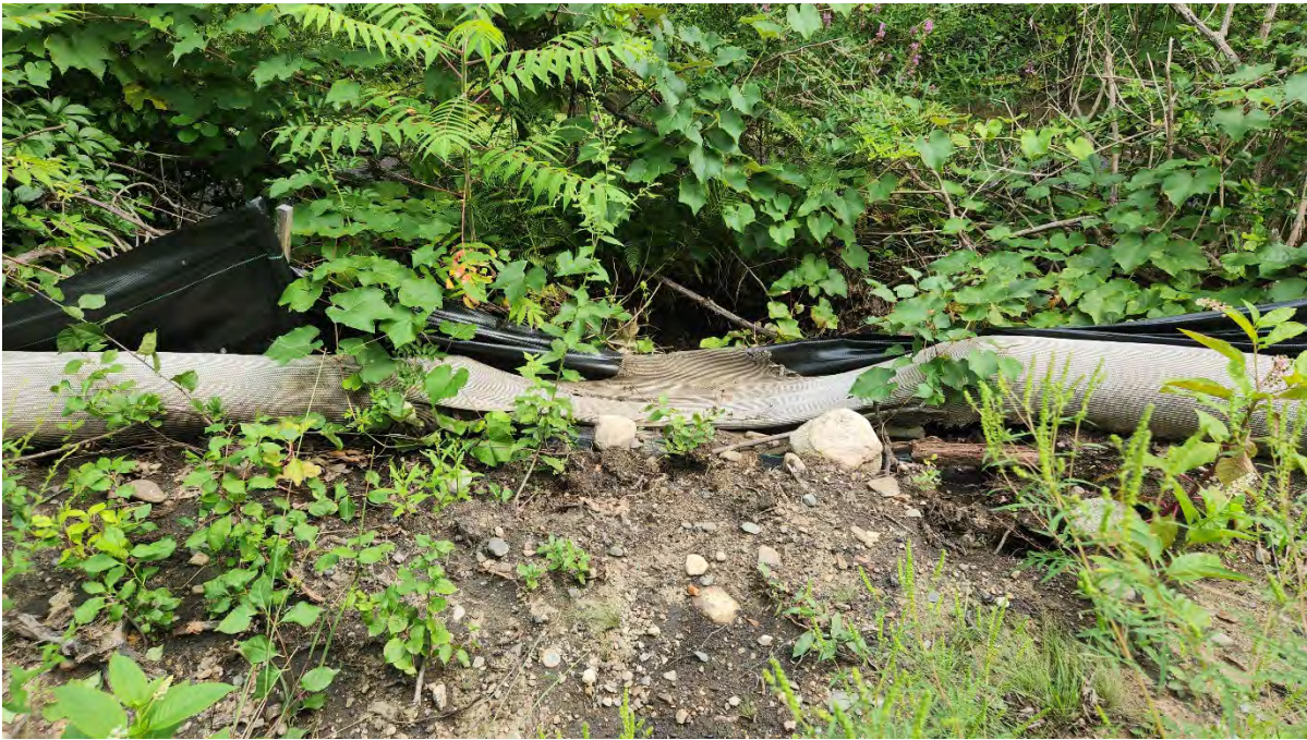
Photo 4: Broken stake in the silt fence and rip in the filter tube along segment 12 adjacent to Hop Brook.