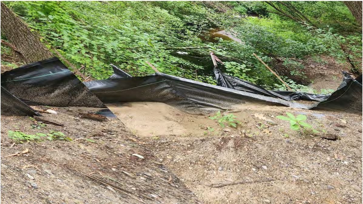
Photo 2: Broken stake in the silt fence along segment 10. Photo taken on 8/21/23