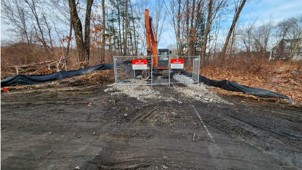
Photo 1: Silt fence at the cleared gravel site entrance (Boston Post Road, STA 476+00). Photo taken on 1/30/23