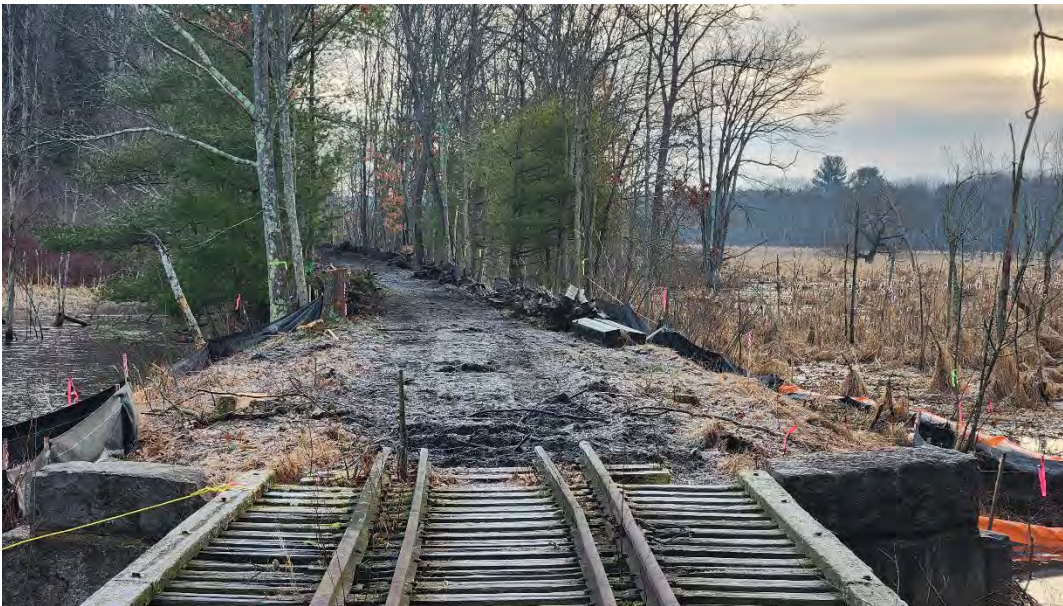
Photo 2: Silt fence installed at the end of Segment 14 (STA 433+50). Photo taken on 1/30/23