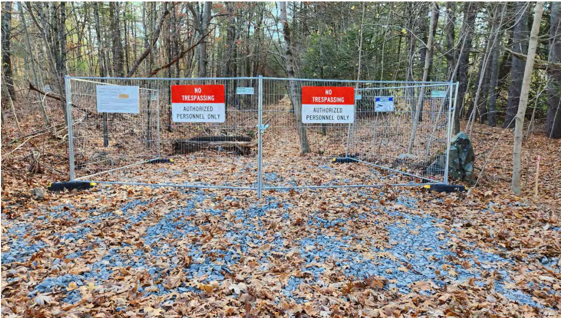
Photo 9: Gravel site entrance (Peakham Road, STA 335+50) predates site activities. Photo taken on 11/18/22