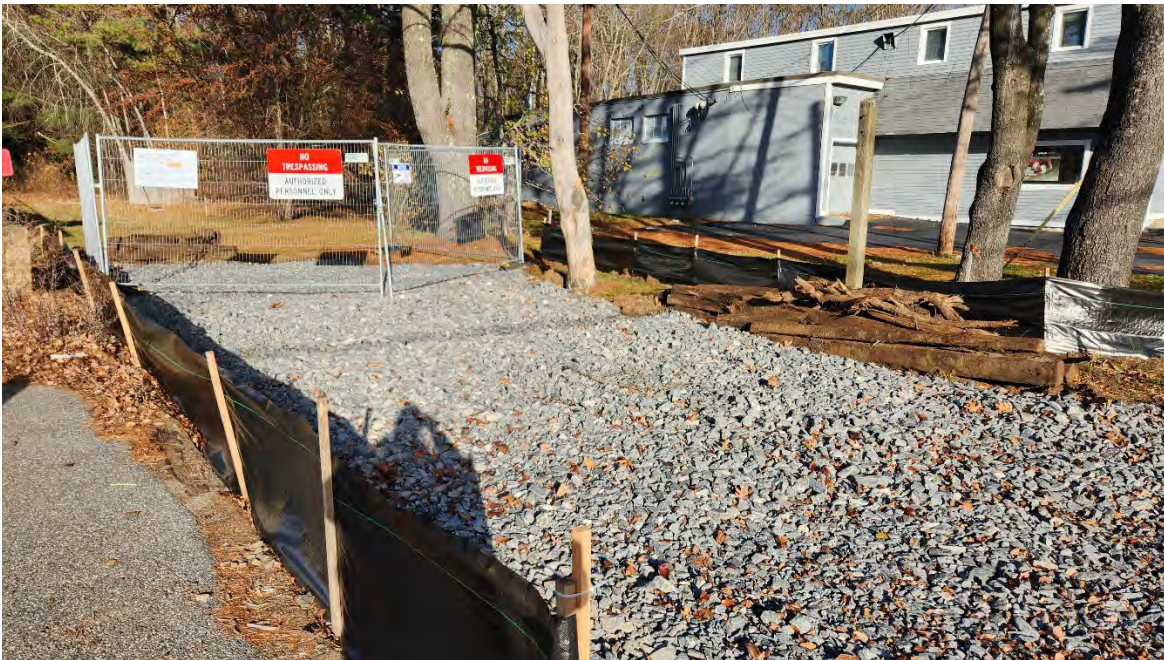
Photo 4: Gravel site entrance (Union Avenue, STA 407+50) predates site activities. Photo taken on 11/18/22

90 Route 6A, Sandwich, MA 02563 112 Water Street, 6 th Floor, Boston, MA 02109 55 Dorrance Street, Suite 403, Providence, RI 02903 113 R2 Water Street, Exeter, NH, 03833