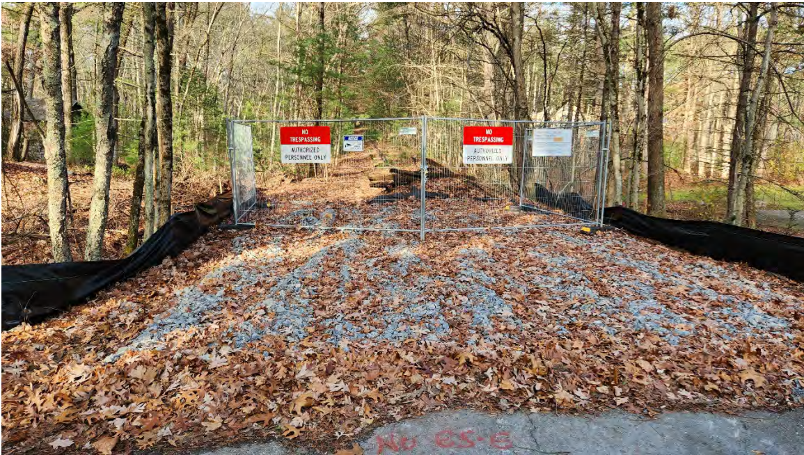
Photo 8: Gravel site entrance (Peakham Road, STA 335+50) predates site activities. Photo taken on 11/18/22

90 Route 6A, Sandwich, MA 02563 112 Water Street, 6 th Floor, Boston, MA 02109 55 Dorrance Street, Suite 403, Providence, RI 02903 113 R2 Water Street, Exeter, NH, 03833