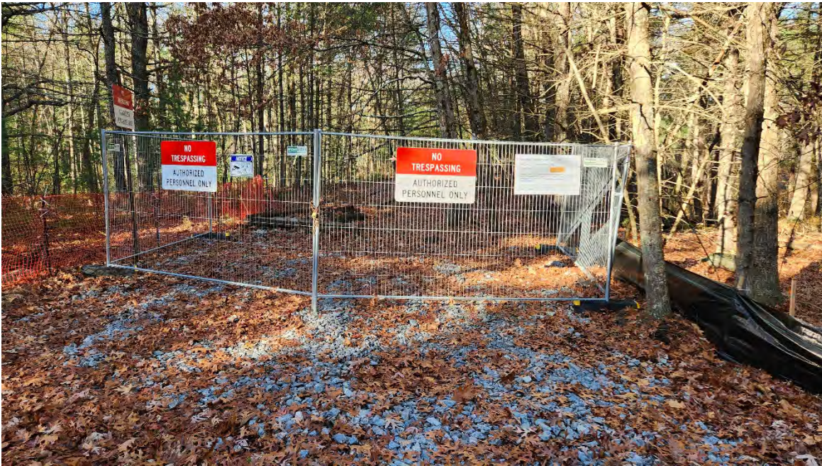
Photo 12: Gravel site entrance (Dutton Road, STA 305+00) predates site activities. Photo taken on 11/18/22