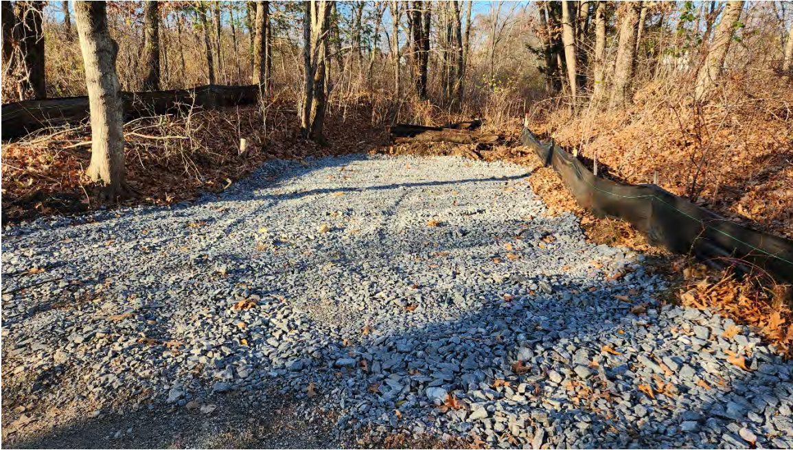
Photo 1: Gravel site entrance (Boston Post Road, STA 476+00) predates site activities. Photo taken on 11/18/22

mbergeron@epsilonassociates.com jbernardo@horsleywitten.com jolidor@horsleywitten.com