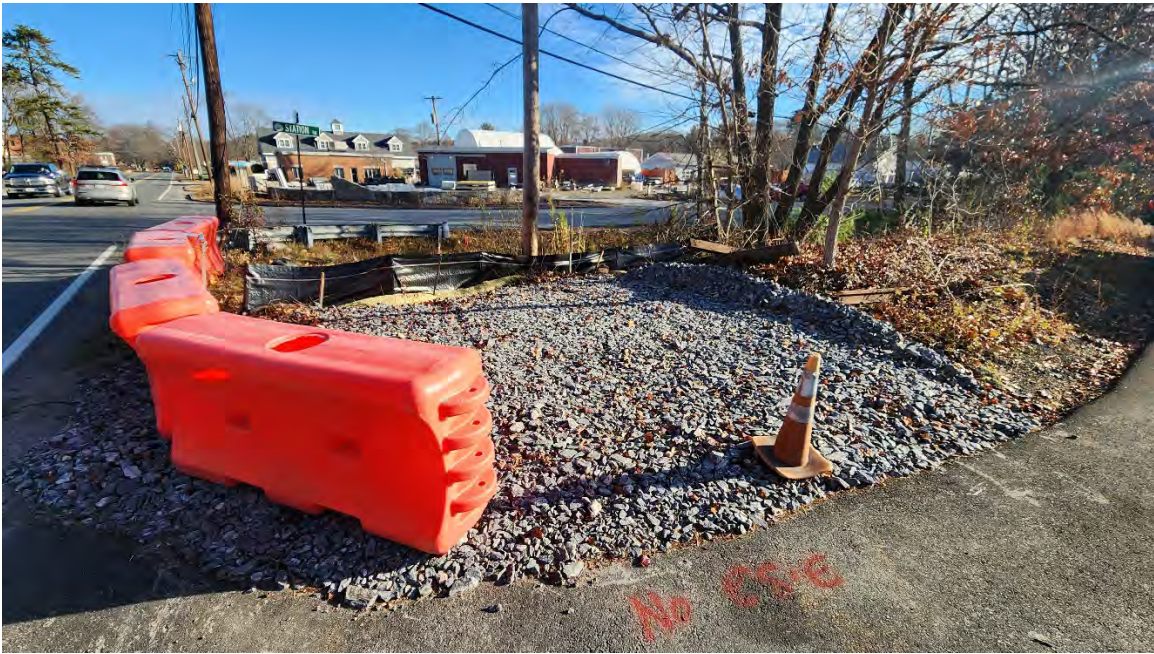
Photo 5: Gravel site entrance (Union Avenue, STA 407+50) predates site activities. Photo taken on 11/18/22