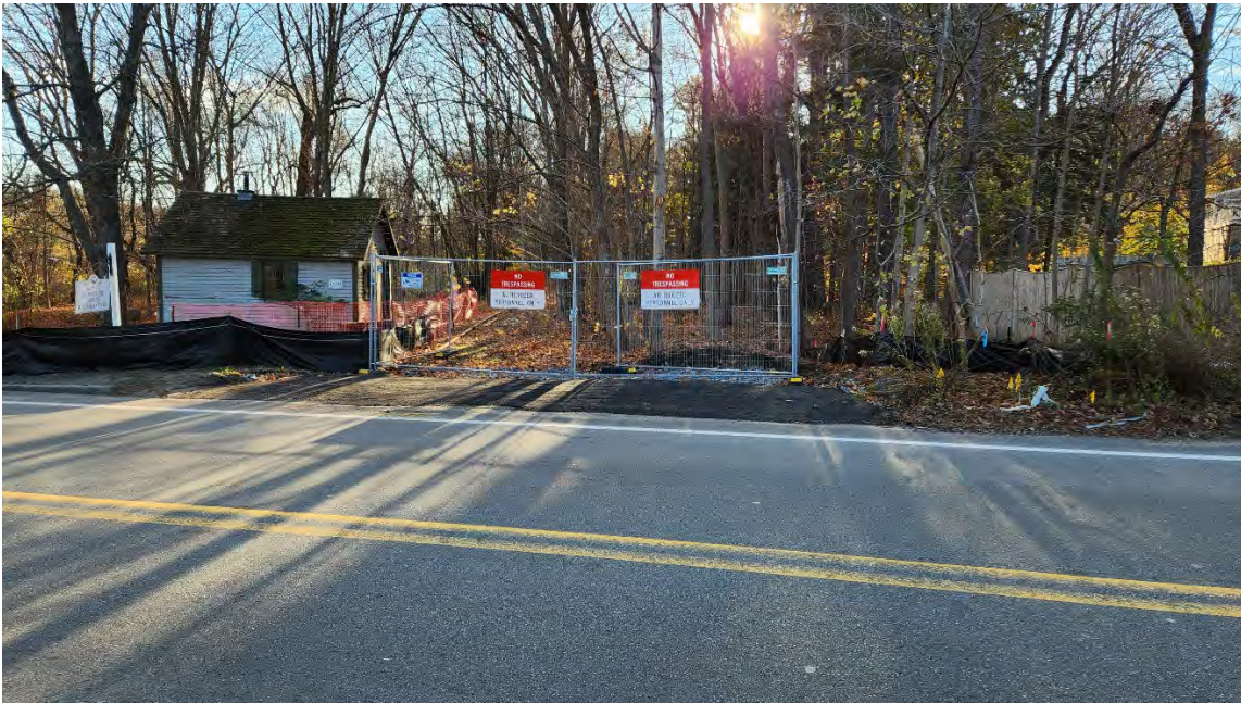
Photo 3: Gravel site entrance (Boston Post Road, STA 420+00) predates site activities. Photo taken on 11/18/22