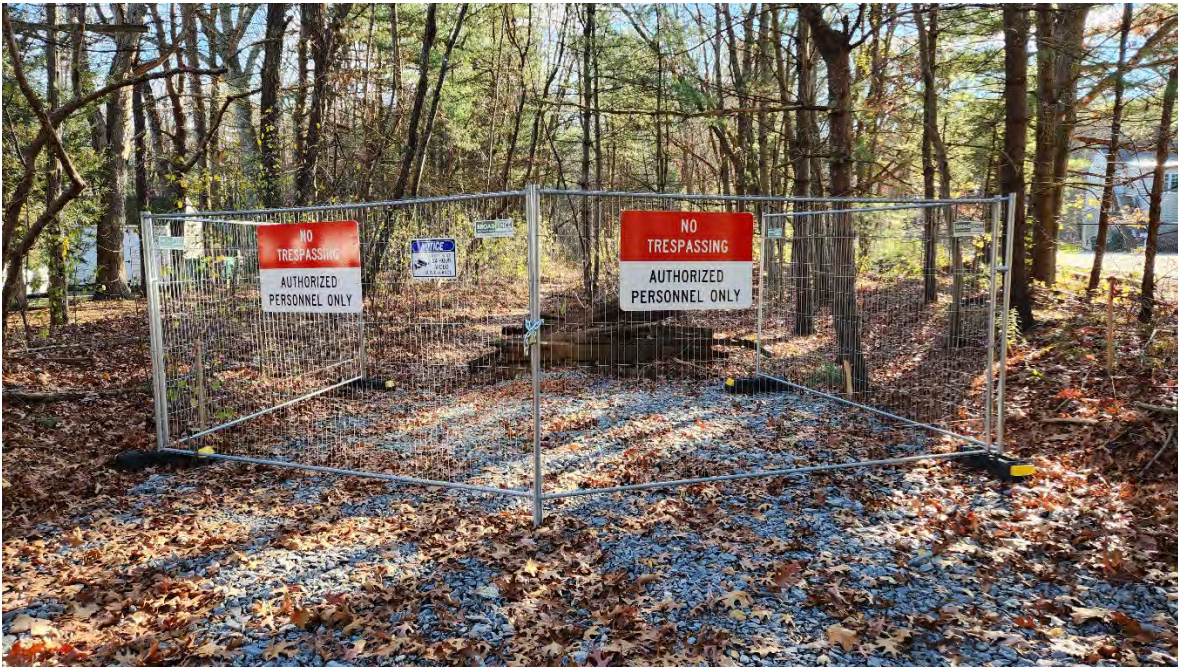
Photo 7: Gravel site entrance (Horse Pond Road, STA 361+00) predates site activities. Photo taken on 11/18/22