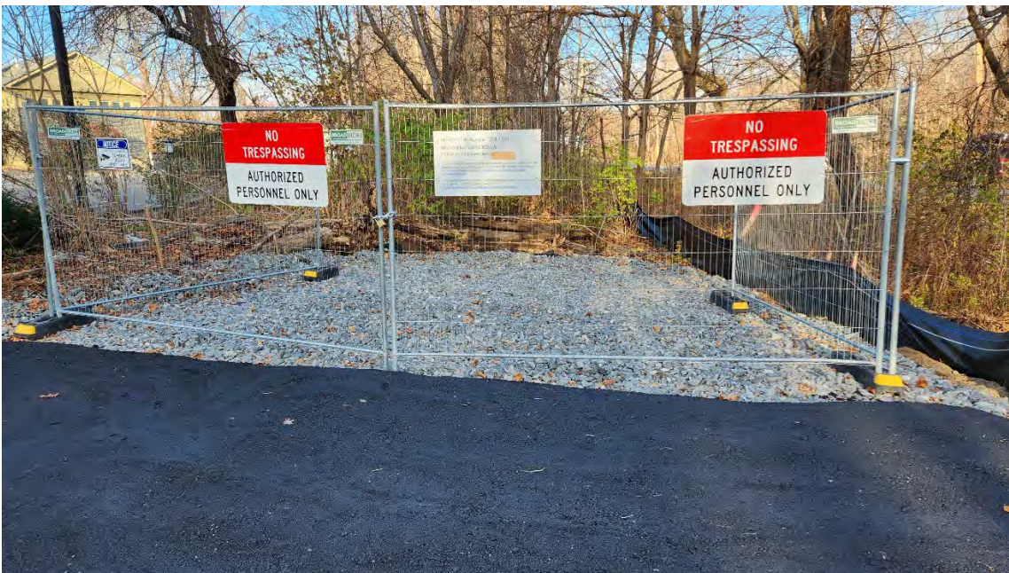
Photo 2: Gravel site entrance (Boston Post Road, STA 420+00) predates site activities. Photo taken on 11/18/22

90 Route 6A, Sandwich, MA 02563 112 Water Street, 6 th Floor, Boston, MA 02109 55 Dorrance Street, Suite 403, Providence, RI 02903 113 R2 Water Street, Exeter, NH, 03833