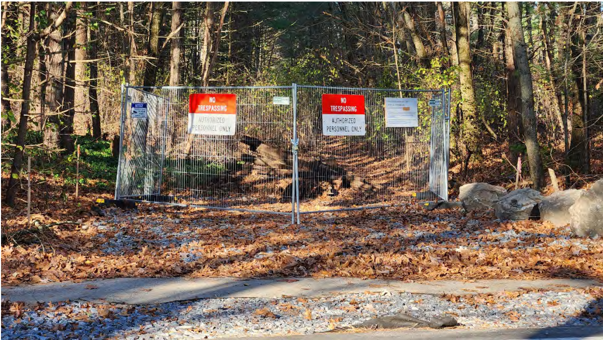
Photo 6: Gravel site entrance (Horse Pond Road, STA 361+00) predates site activities. Photo taken on 11/18/22

90 Route 6A, Sandwich, MA 02563 112 Water Street, 6 th Floor, Boston, MA 02109 55 Dorrance Street, Suite 403, Providence, RI 02903 113 R2 Water Street, Exeter, NH, 03833