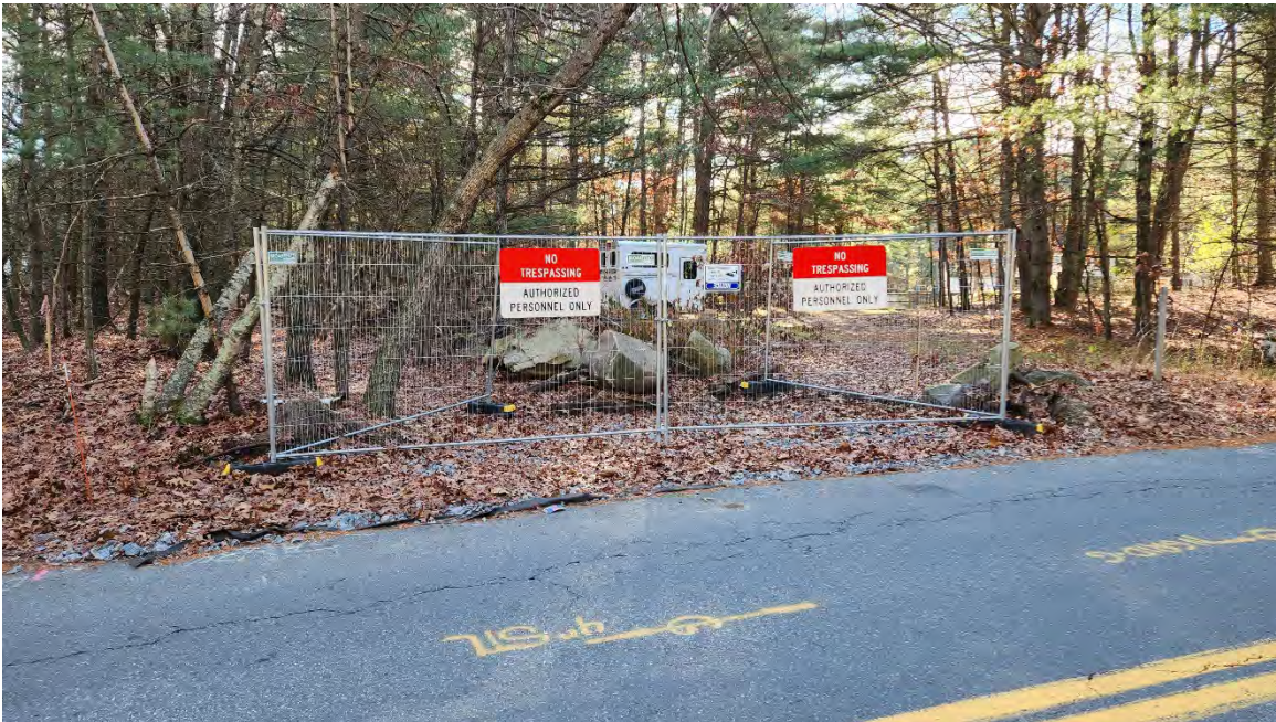
Photo 10: Gravel site entrance (Dutton Road, STA 305+00) predates site activities. Photo taken on 11/18/22

90 Route 6A, Sandwich, MA 02563 112 Water Street, 6 th Floor, Boston, MA 02109 55 Dorrance Street, Suite 403, Providence, RI 02903 113 R2 Water Street, Exeter, NH, 03833