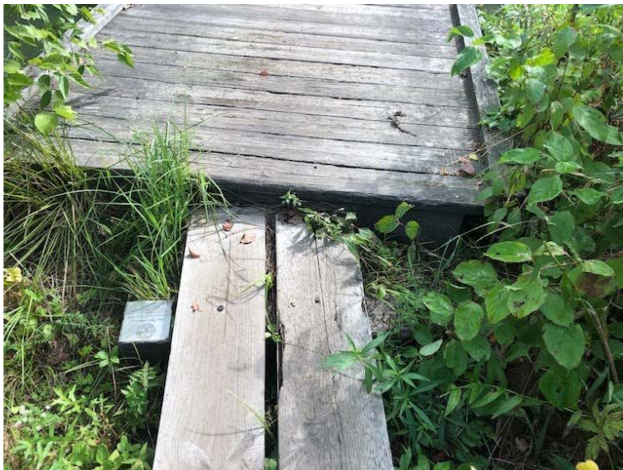
This is one end of the boardwalk where it meets the bridge.