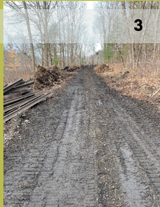
Work on the Eversource underground transmission line project shown left to right: 1) During Tree Removal, 2) Following Chipping Operation and 3) Following Rail/Tie Removal