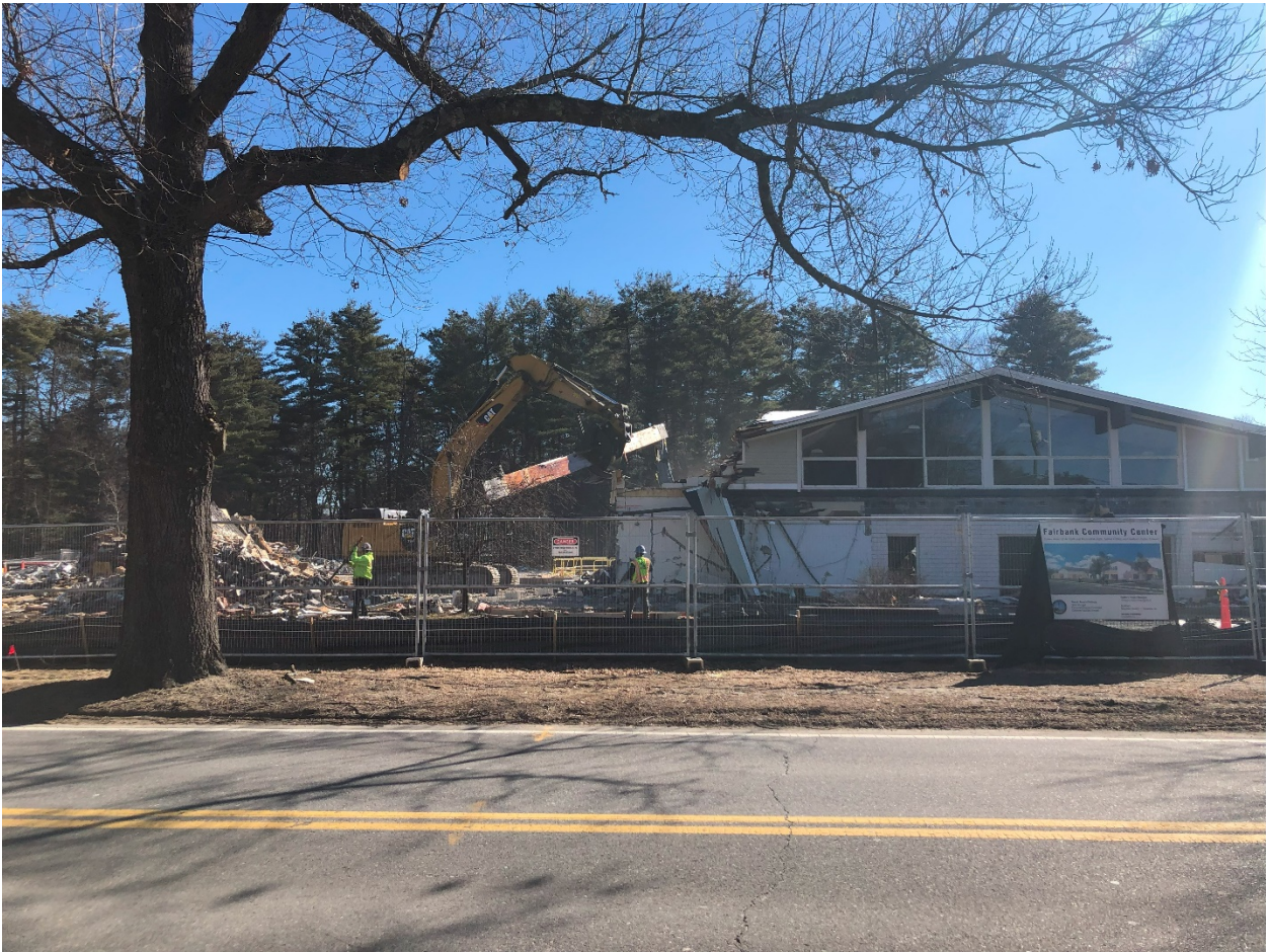
Special equipment was brought in to remove the large steel beams.