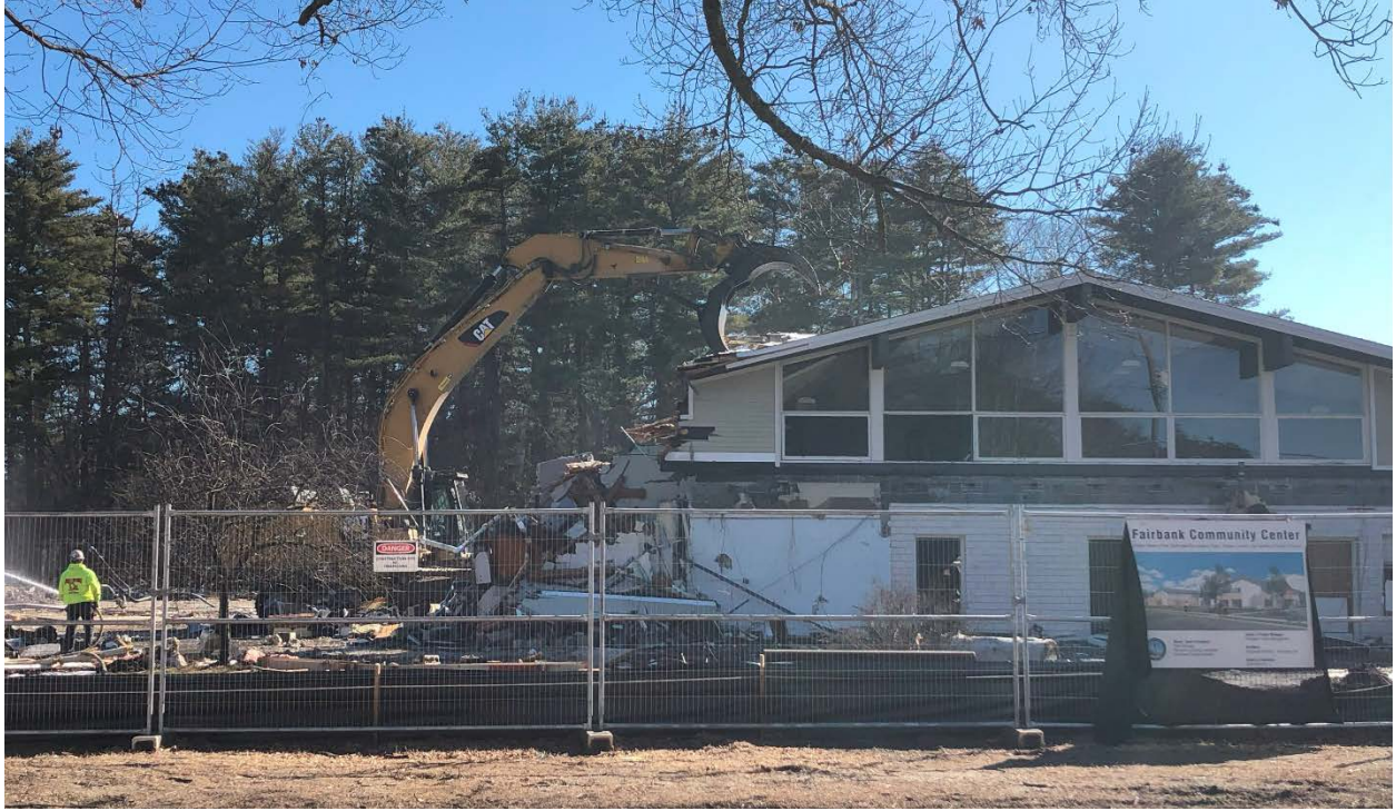
Next it was time to tackle the gym demolition.