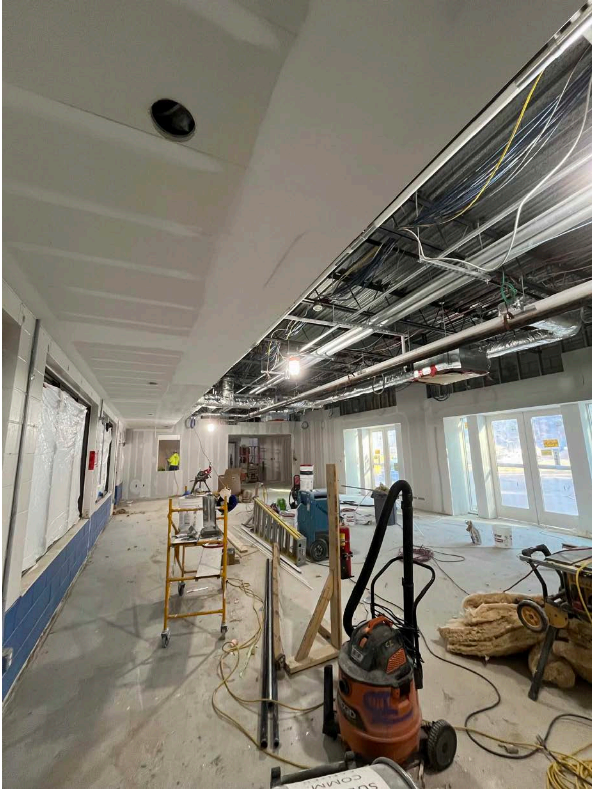
Inside the pool viewing room there are views into the pool (through the existing windows on the left) and to the outside.