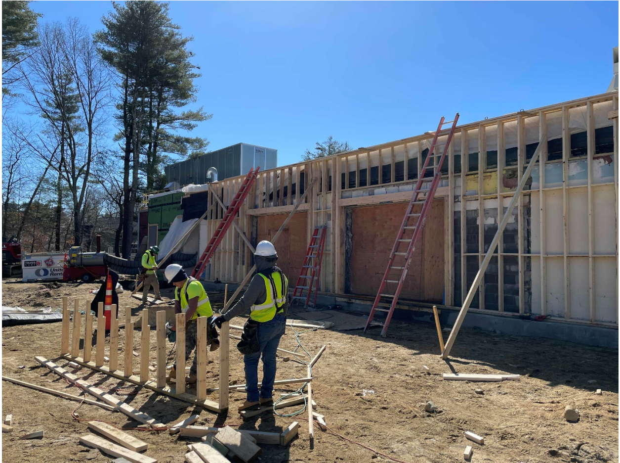
The exterior wall of the pool viewing room was previously an interior wall. Framing was added to allow for insulation.