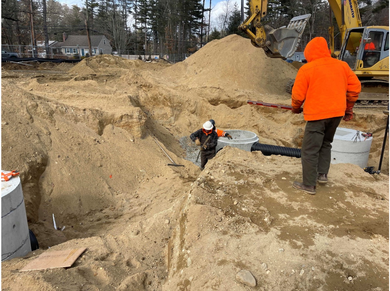
Drainage system structures were installed below the new parking lot.