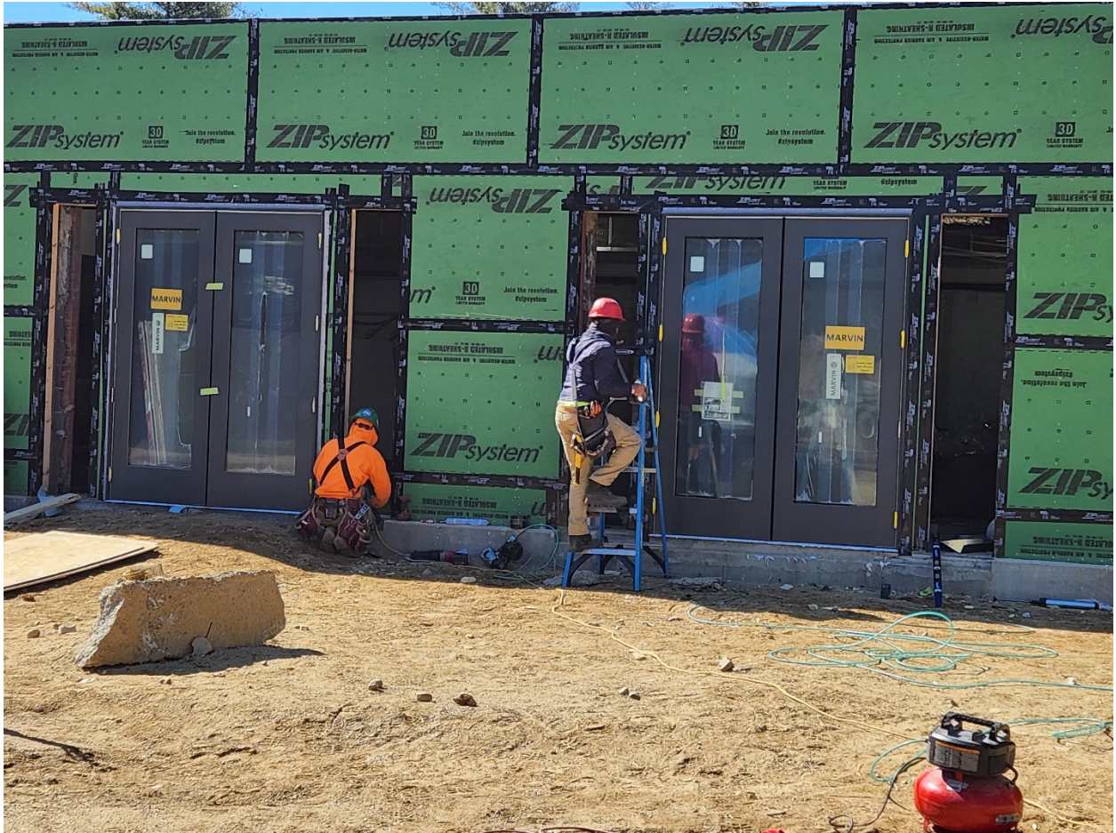
Exterior sheathing was completed and new glass doors and sidelights were installed to allow light to penetrate the pool viewing room.