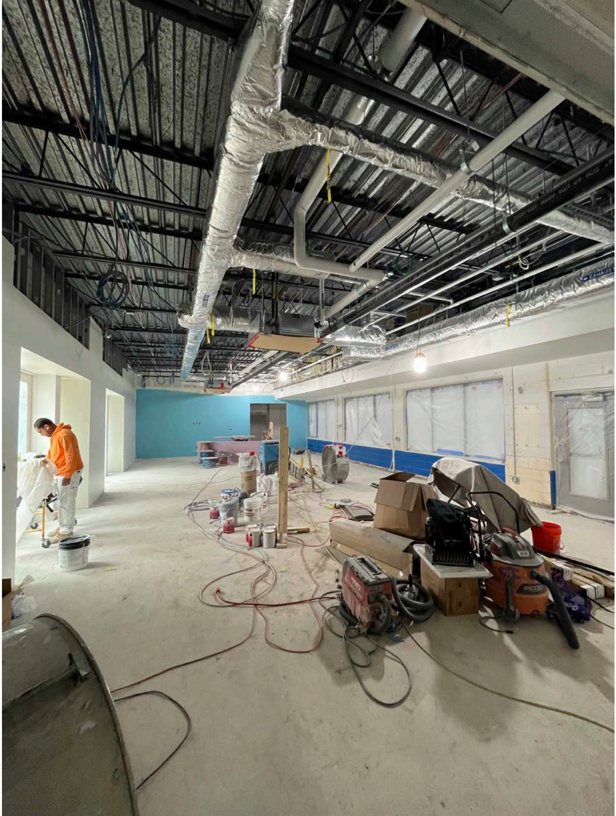
Looking from the other direction, the pool is to the right.