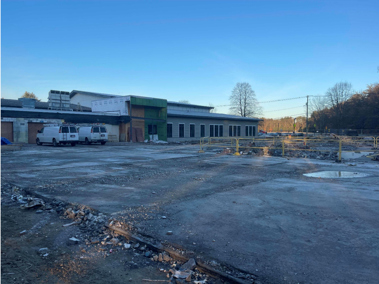
With the old building down and debris hauled away, the first glimpse of the Park and Recreation side of the new building became visible.