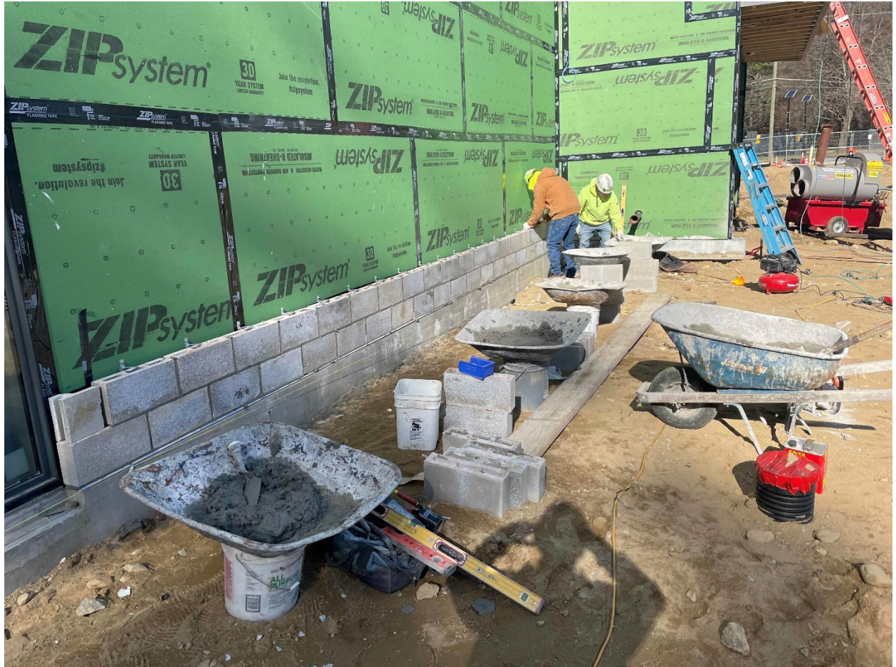
The masonry base was recently installed.