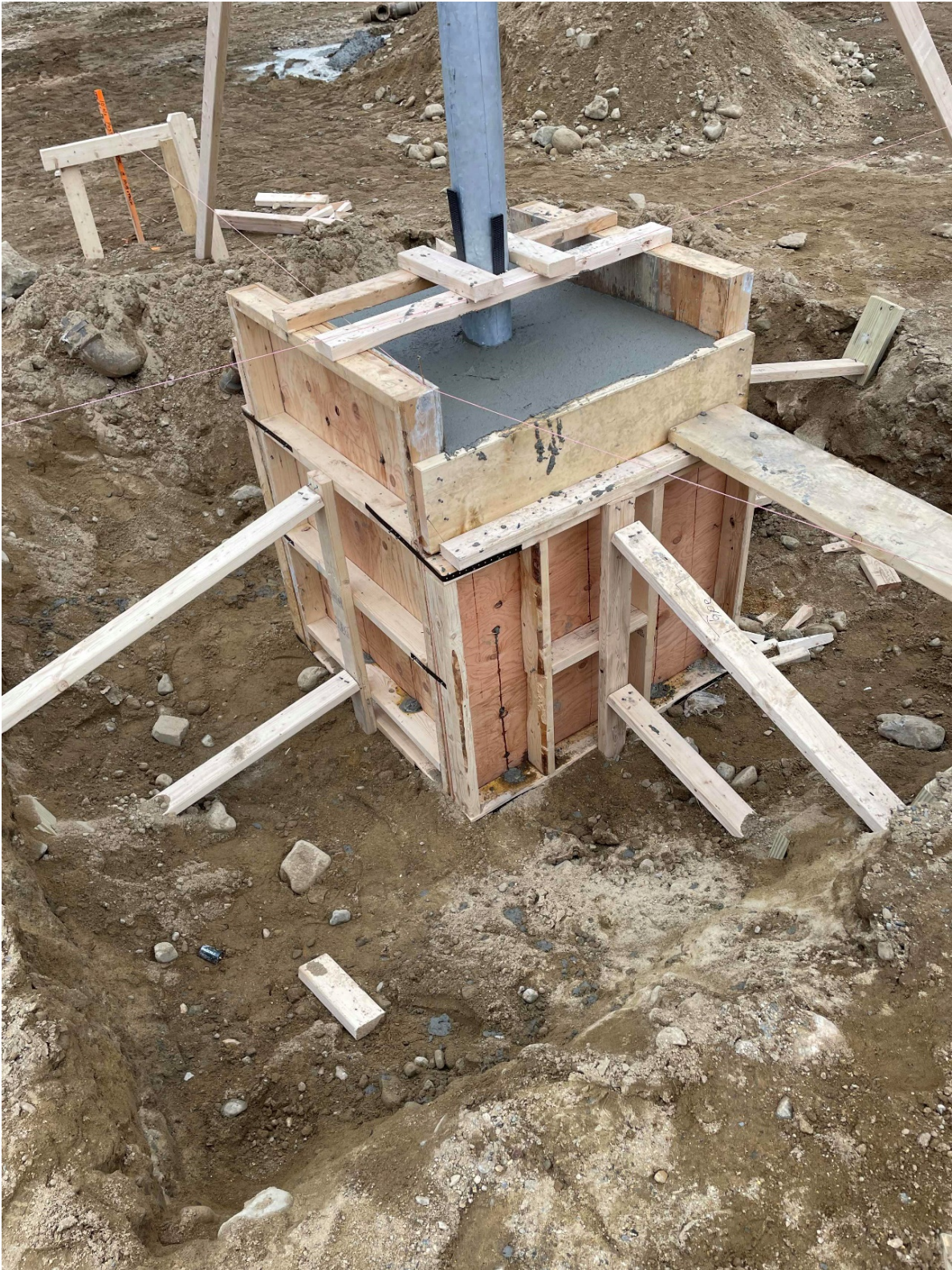
The base for a basketball pole is substantial!

Sitework began with the installation of basketball poles and drainage structures.