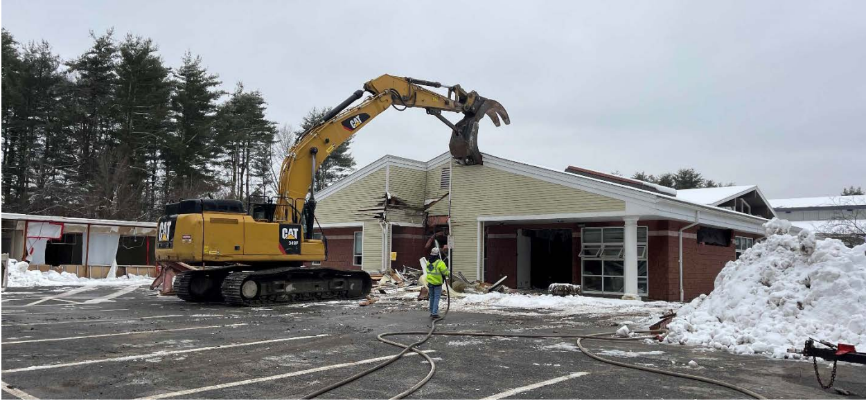
After remediation of asbestos and other materials was completed at the end of January, the school wing was a shell of its former self, and the Senior Center demolition began.