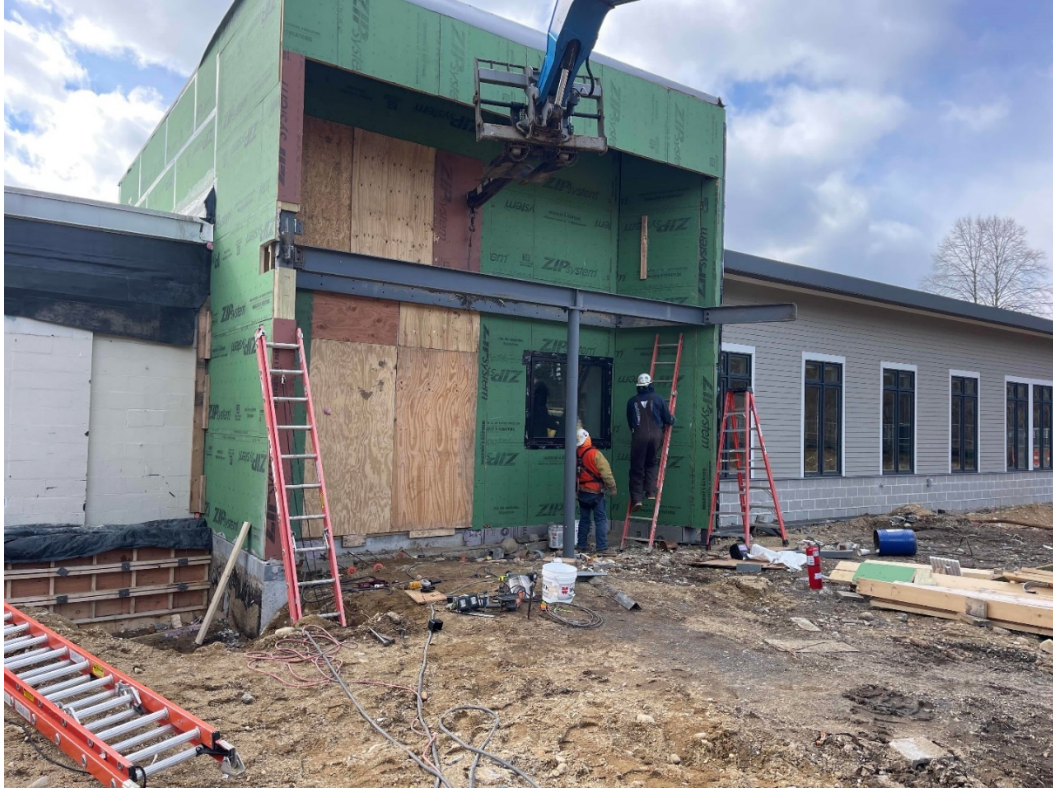
Work began with the steel framing at the entry canopy.