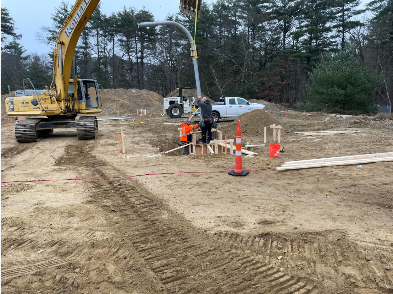
Installing a basketball pole.