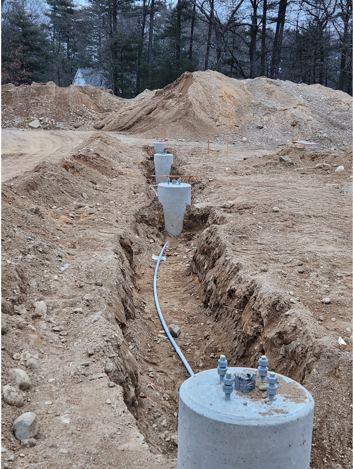
Light pole bases are going in and the electricians are running power to them this week.