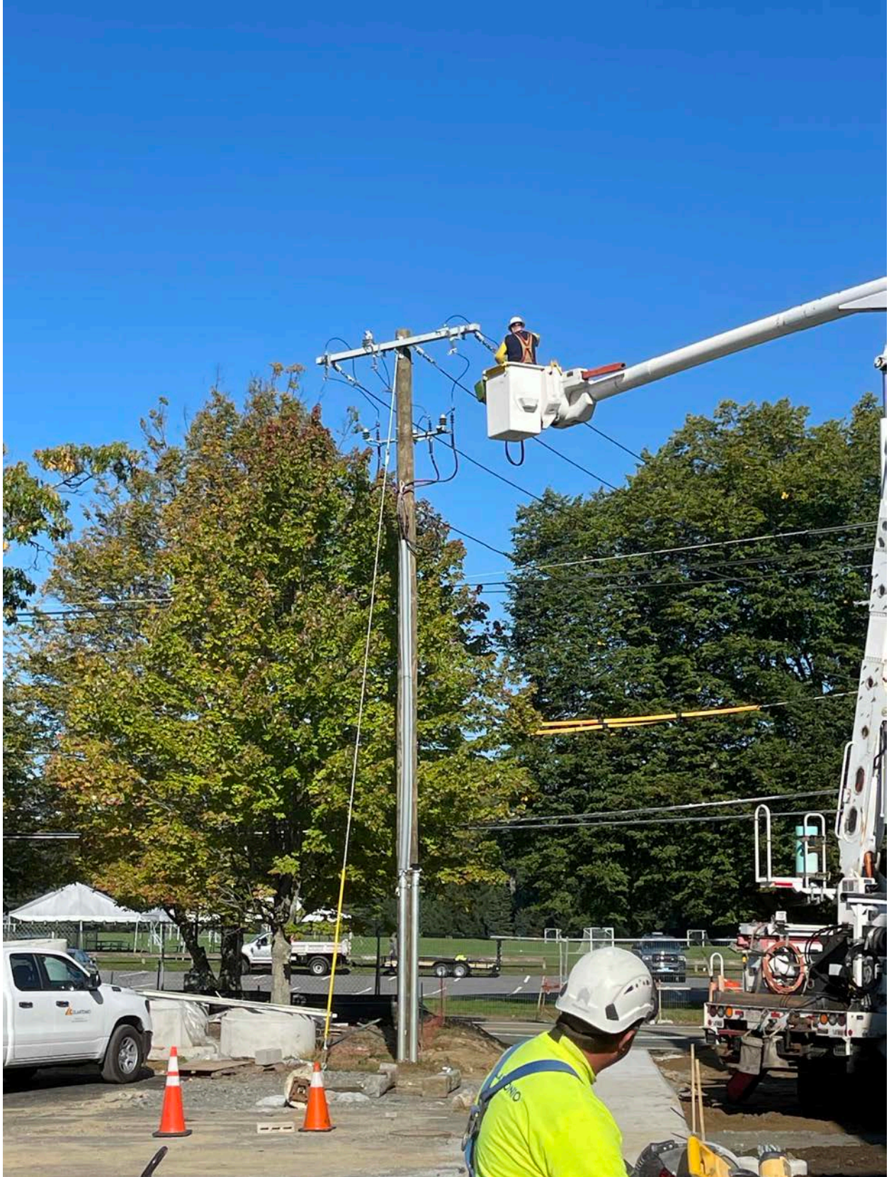
We'll leave you with this image, a major milestone for the project team! Stay tuned...