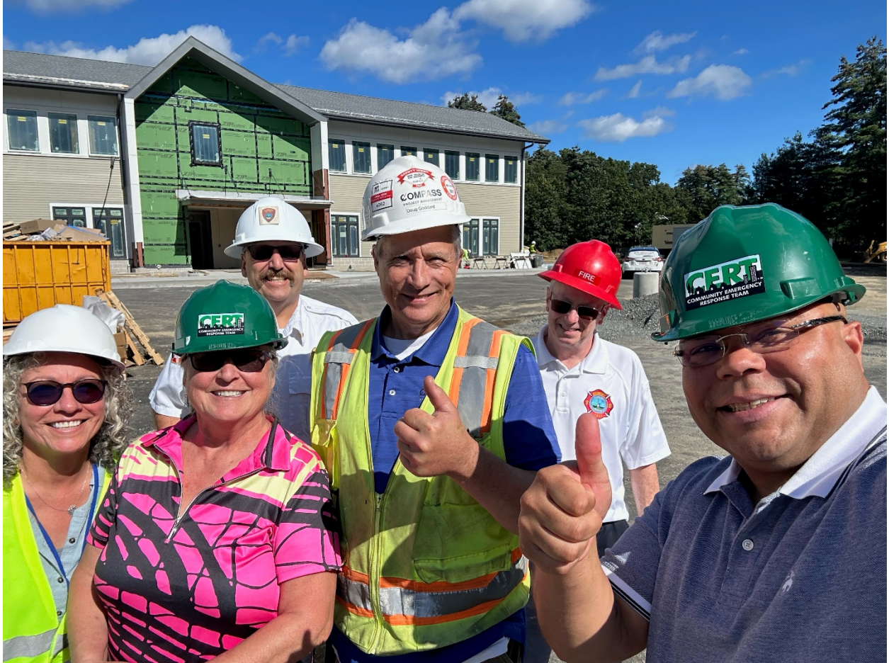
The emergency shelter team inspected the building and gave it a thumbs up. 🍷