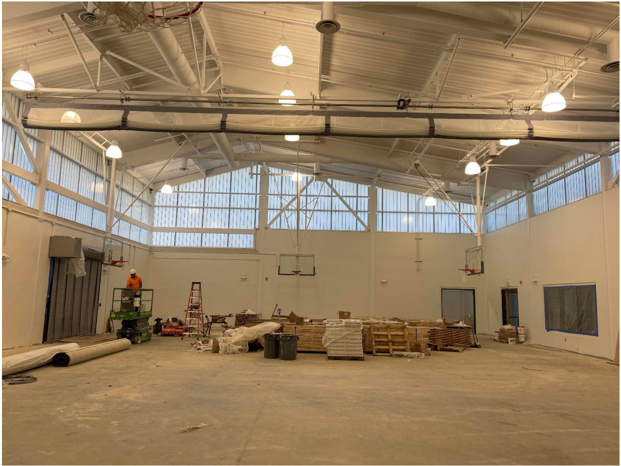
The lights are on and basketball hoops are hung in the gym! Gym flooring will soon be installed.