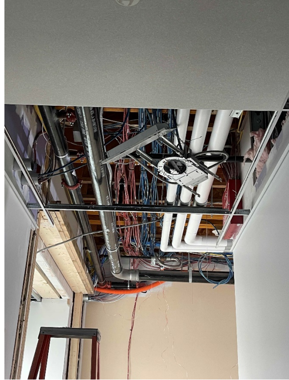
There's a lot going on above the ceilings....