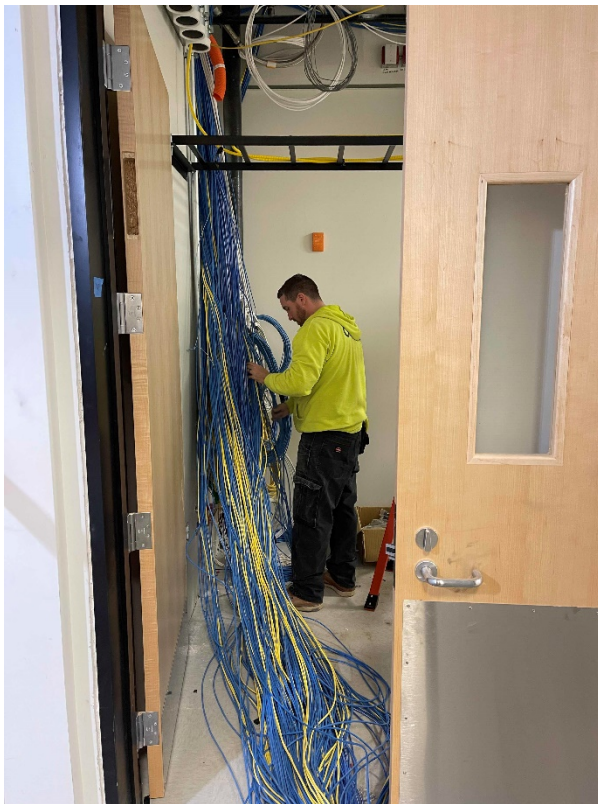
And tons of wire for all the technology!