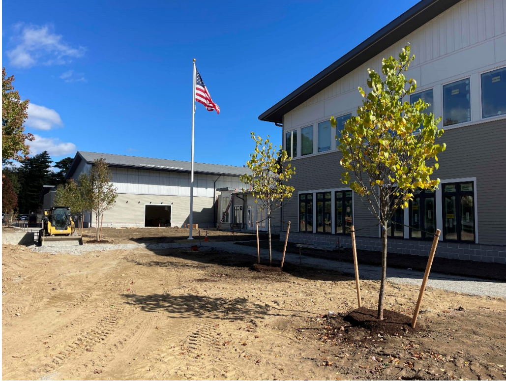
View of the outdoor Commons area along Fairbank Road, from the walkway to Haskell field parking. The gym is behind the flagpole, Senior Center and SPS offices in the foreground.