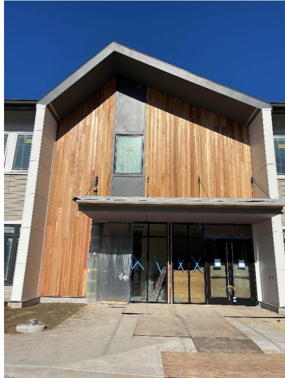
Views of the Senior Center and SPS entry from the sidewalk to Haskell field and the parking lot.