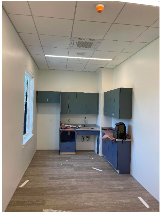
Cabinetry at the coffee station outside the SPS conference rooms, and in the SPS break room.