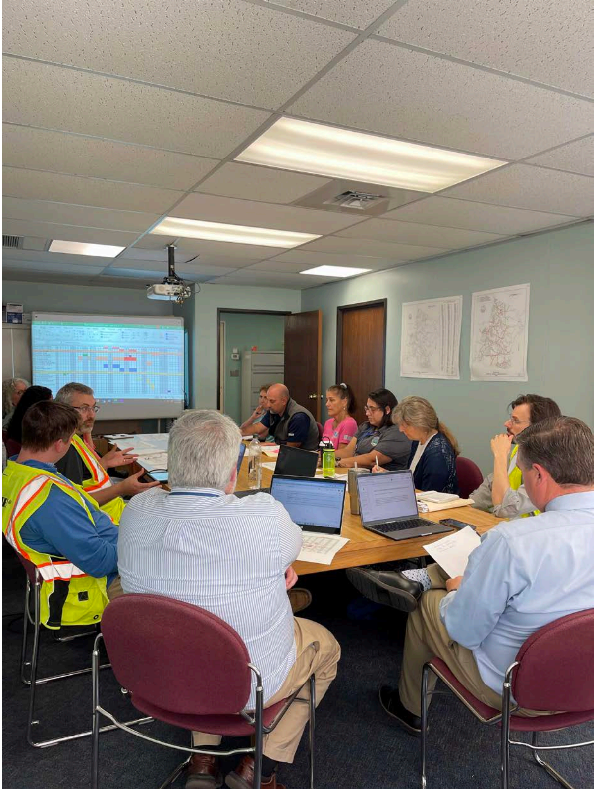
And the project team met with the staff to discuss the moving process.