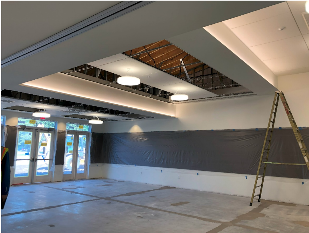
The stepped ceiling in the Multi-purpose room.