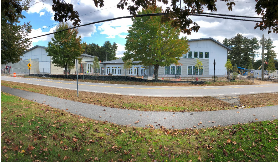
Overall view of the Fairbank Community Center from the Haskell fields parking lot.