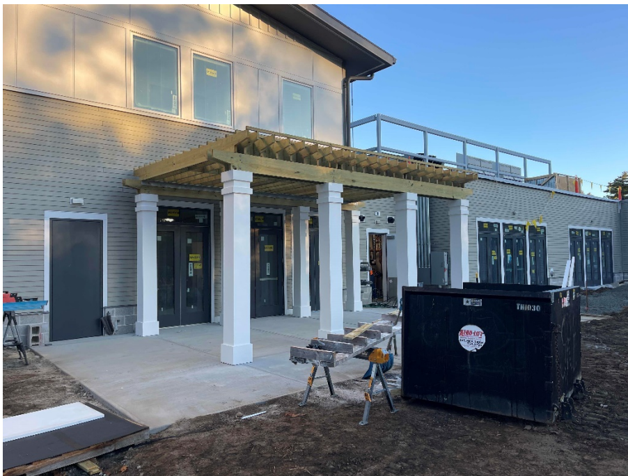
The trellis-covered patio outside the Senior Center lounge. Fitness Center and Arts and Crafts rooms are to the right and open onto what will be a lawn area for outdoor activities from those program spaces.