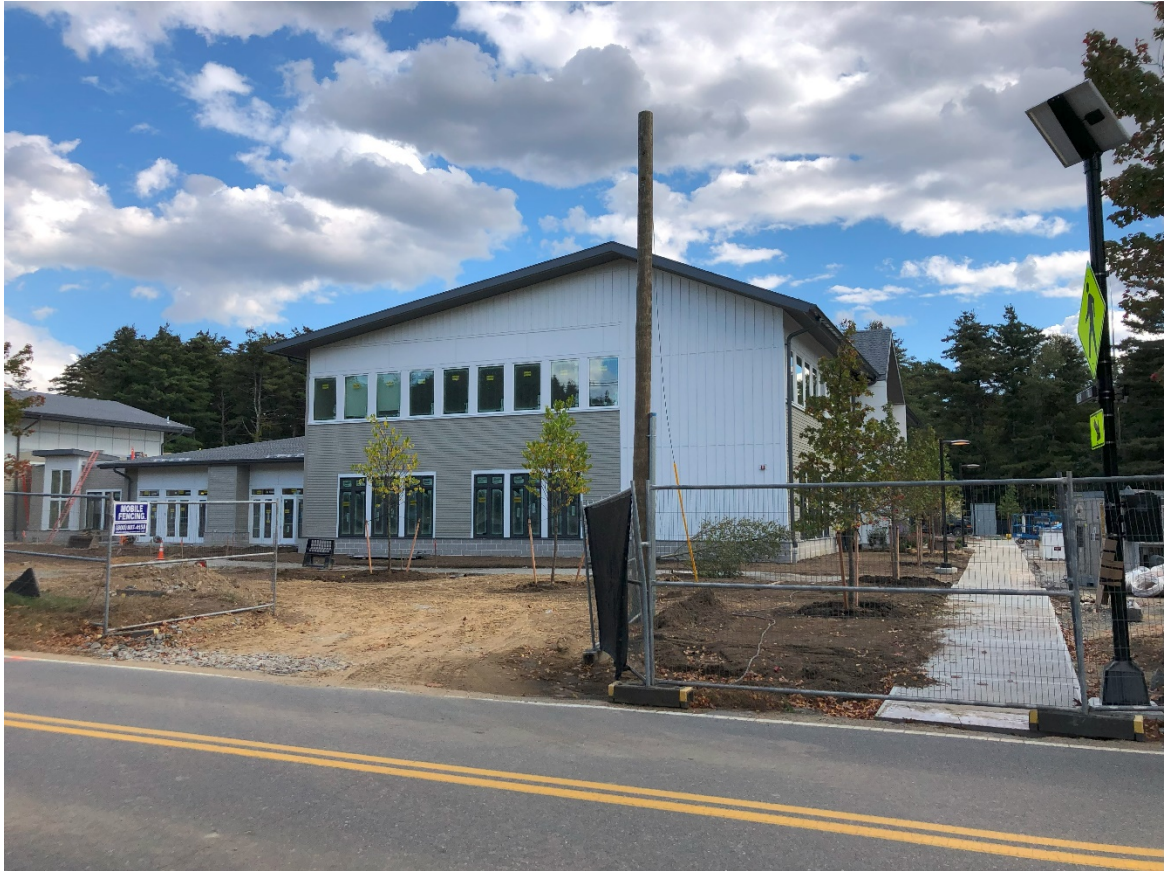
Approaching the Senior Center/SPS Offices side from the crosswalk to Haskell parking lot.