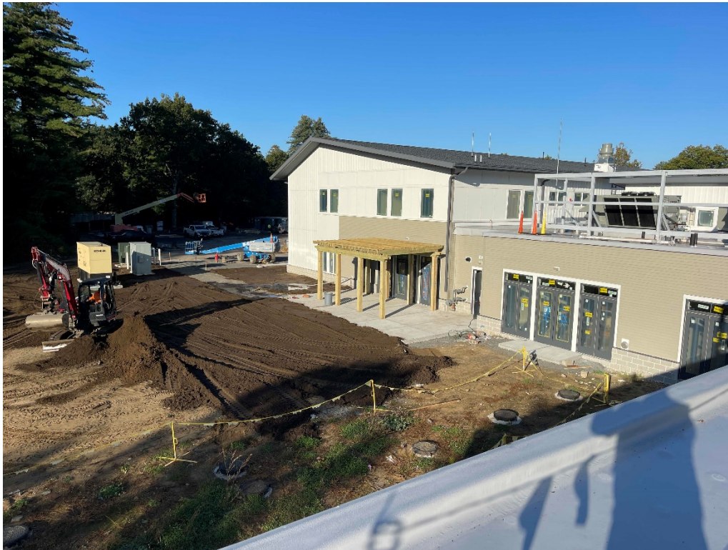
Spreading loam outside the rear of the Senior Center, around the trellised patio.