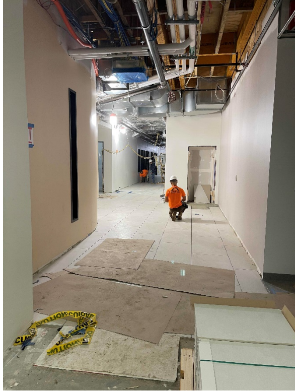
Laying tile in the Senior Center lobby and café area (left) and Park and Rec main corridor.