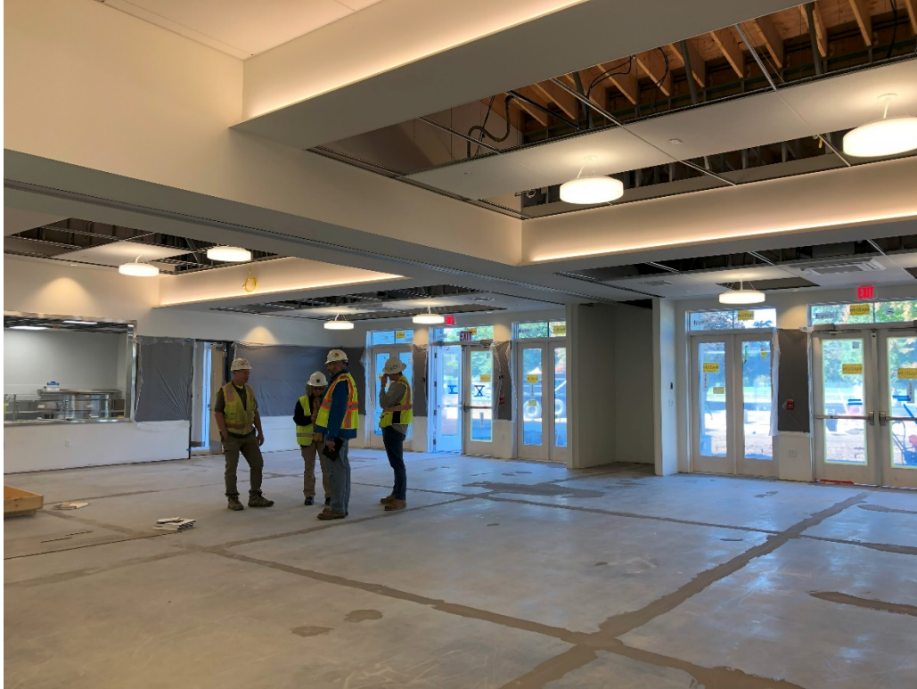
Ceiling installation in the Multi-purpose room continues. Lights are ON!