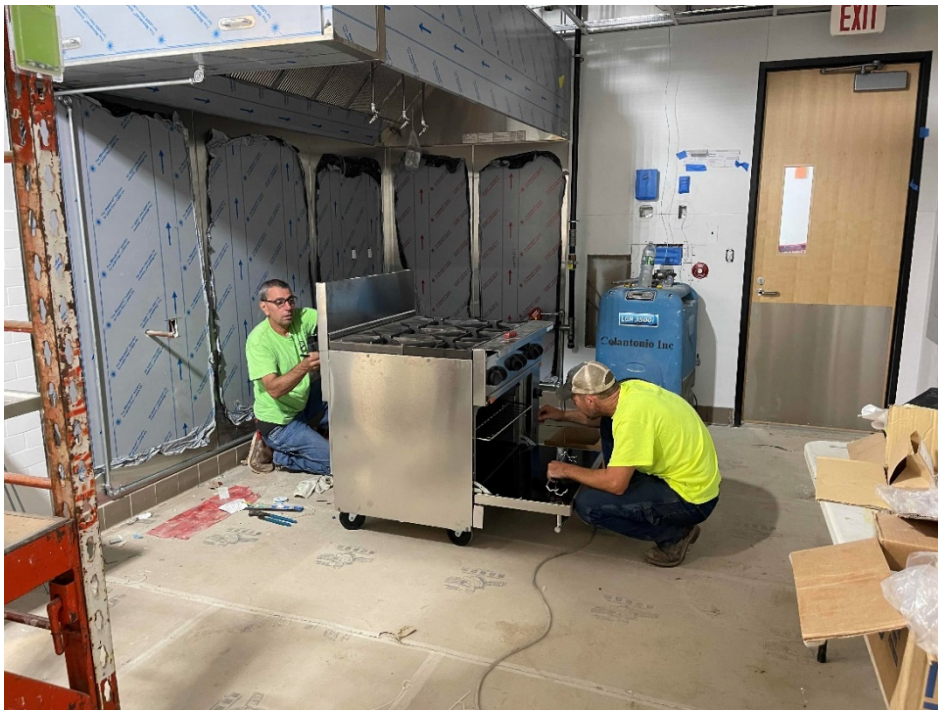
Preparing to install equipment under the exhaust hood in the kitchen.