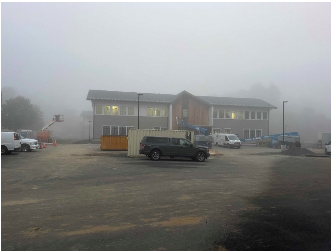
The lights are ON! View from the parking lot at the Senior Center and SPS side.

You may have heard about additional leaks in the pool and schedule delays as a result of delayed permanent power connections pushing back the move date. The project team is working hard to minimize delays and disruptions to the ongoing programming, in coordination with the staff from the three user groups. Transition planning is underway with staff, and they are in the midst of packing and purging, readying for a move sometime between Thanksgiving and Christmas. The building is expected to be open to the public soon after the holidays. Your patience is appreciated.