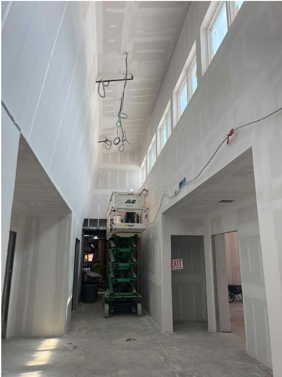
Clerestory windows in the shared use corridor let in southern daylight.