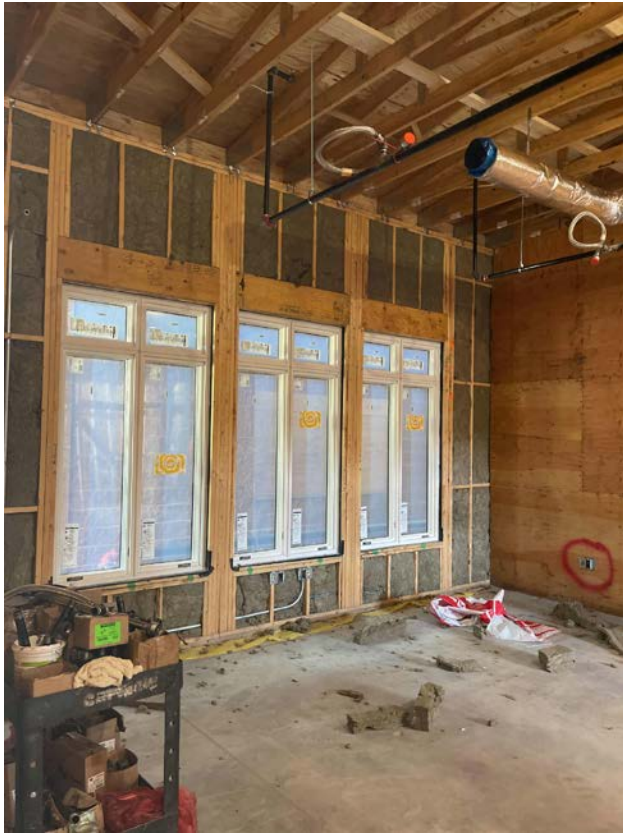
Insulated walls in a Park and Rec program room.