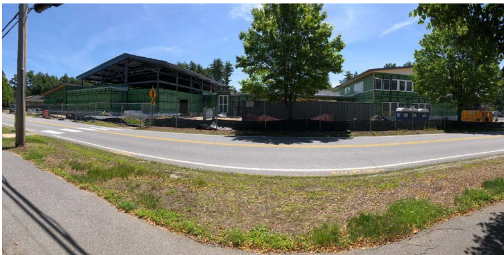
The whole center, with the gym and Park and Rec on the left, SPS and Senior Center on the right, and shared spaces and an outdoor “Commons” lawn in the center.