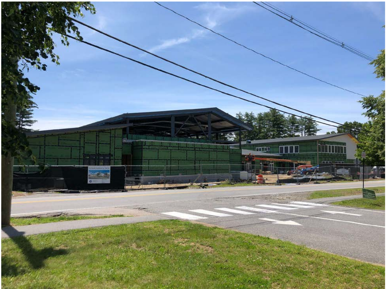
View from the Park and Rec side