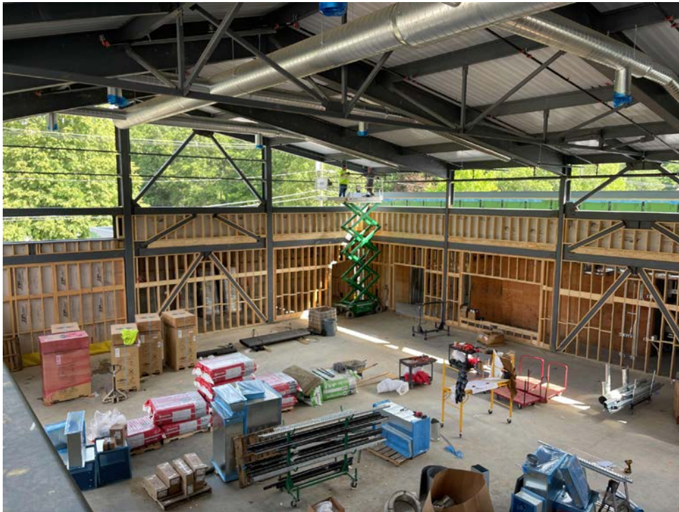
The full size gym is framed and waiting for polycarbonate panels that will allow for diffused daylighting. (View taken from the adjacent roof)