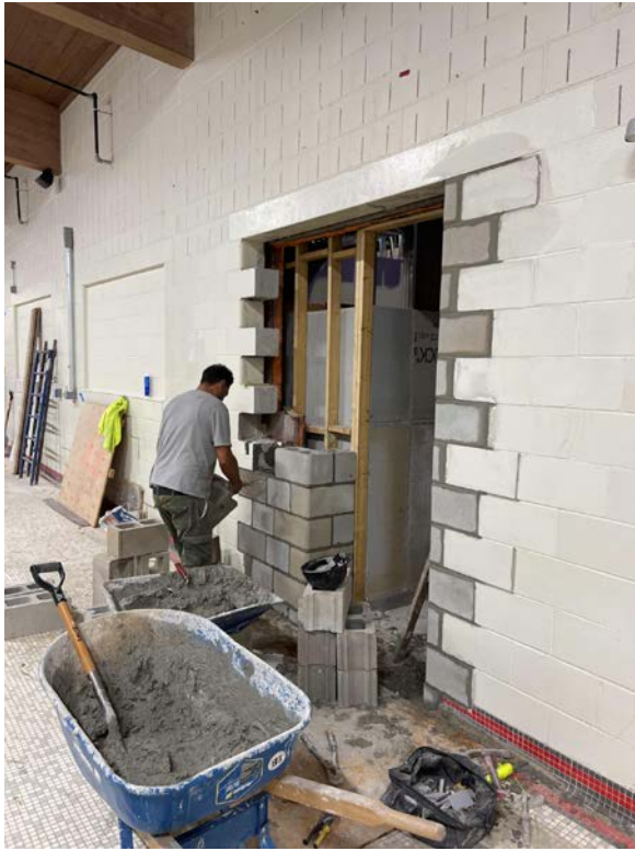
New openings in the pool wall for doors to new locker rooms....