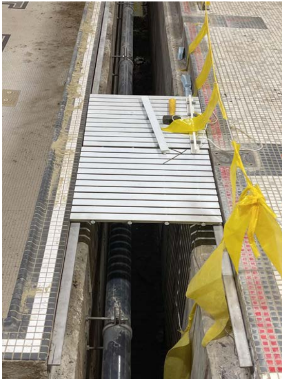
And new gutters along the pool edge!