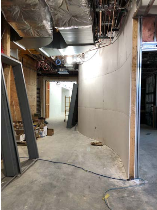
A curved wall lines the main corridor in Park and Rec, with a dedicated toddler/preschool program room on the other side of the wall. This is located at the transition point from the Park and Rec corridor into the shared use space ahead and the corridor leading to the locker rooms to the left.