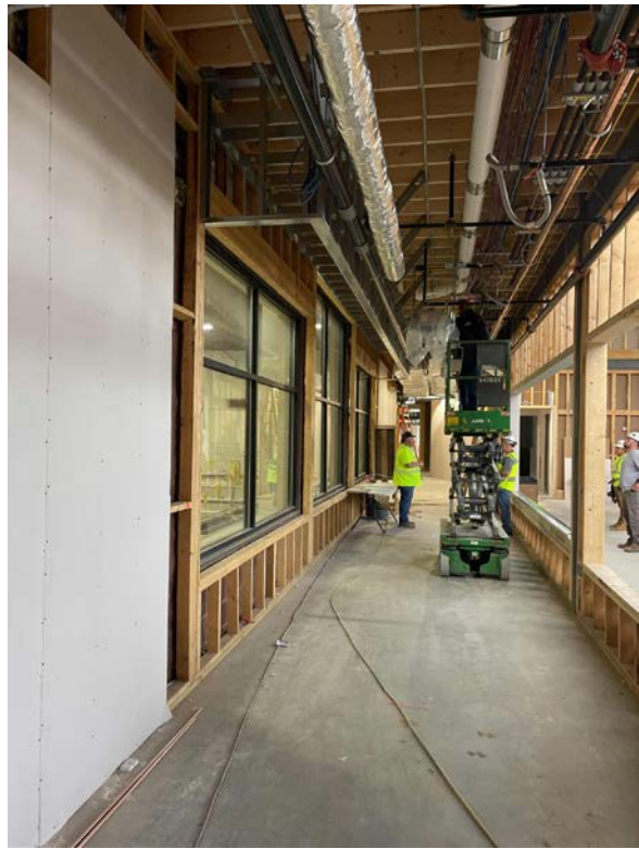
Large interior windows will allow views into the gym and daylight to spill into the corridors. The existing pool windows are directly across from the gym windows.