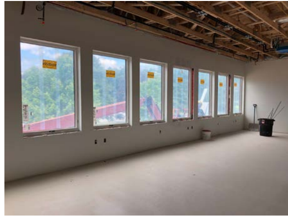
Painting is ongoing in the Senior Center (left) and complete in the SPS offices (right)